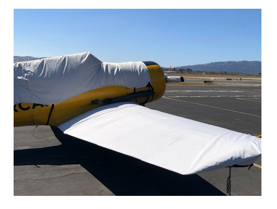
North American Harvard T6 Canopy & Wing Covers

This cover type is made from Silver Acrylic Sunbrella canvas and is 100% lined with a soft and smooth microfiber. Bruce's Custom Covers developed this material combination especially for aircraft protection. The outer material is medium weight and treated for water resistance, UV resistance and anti-static buildup. The inner lining is a very soft and smooth microfiber to prevent scratching. The material is very reflective, and tests show that the cabin interior temperature can be reduced to near-ambient temperature on the hottest of days. It is water, ice and snow repellent, yet breathable to allow moisture to escape from between the cover and the aircraft surface.