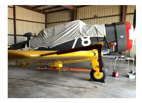
North American T6 Pitot cover (straight bayonet type)

Engine Inlet Plugs are custom fit for your North American T6, SNJ, Harvard intakes, made with heavy-duty vinyl material, and stuffed with a single block of sculpted urethane foam. Each plug has a zipper that allows the foam to be removed and dried if necessary. Engine plugs have warning flags that are visible from the cockpit or 'remove before flight' streamers sewn onto the face of the plugs. Most plugs are imprinted with the aircraft registration number in black for an extra charge. Storage bag NOT included. Engine plugs may be inserted after flight when the engine is still warm. Engine Inlet Plugs are commonly referred to as Cowl Plugs, Intake Plugs, Cowl Blocks, Engine Blocks, and Engine Bungs.