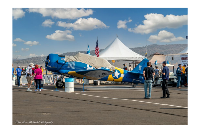
North American Harvard T6 Canopy, Prop & Wing Covers