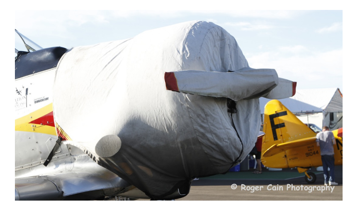
North American T6, SNJ, Harvard Canopy Cover With 48" Fwd Ext