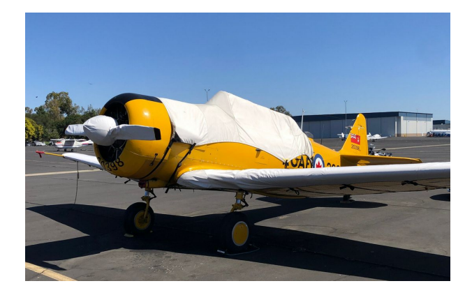
North American Harvard T6 Canopy, Prop & Wing Covers

WINTER USE MATERIAL - Made with Solution-Dyed Polyester fabric, this option is intended for seasonal use to aid in deicing, rain mitigation, or for occasional travel. The material is lighter and more compact, but more susceptible to UV damage and may have a shorter useful life if used continuously outside than the all-year use material.