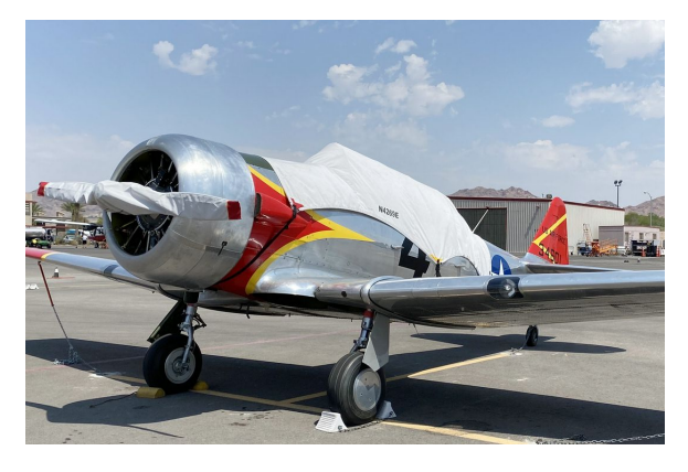
North American T6 Canopy & Prop Covers