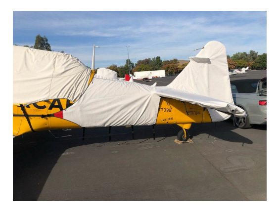
North American T6 Empennage Cover