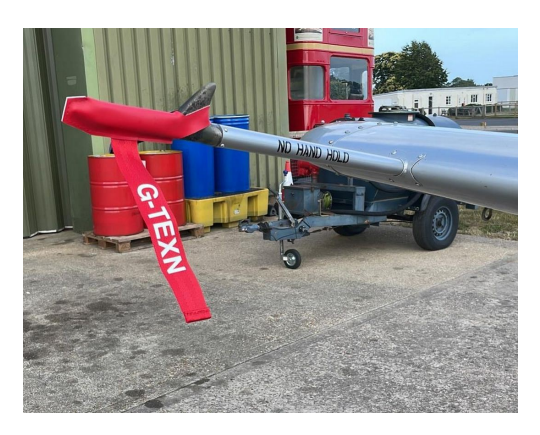
T6 Harvard Pitot Cover, shark fin type