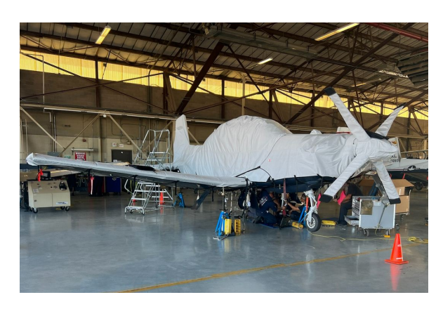
Beech T-6A Texan 2 Complete Hail Protection Cover Set