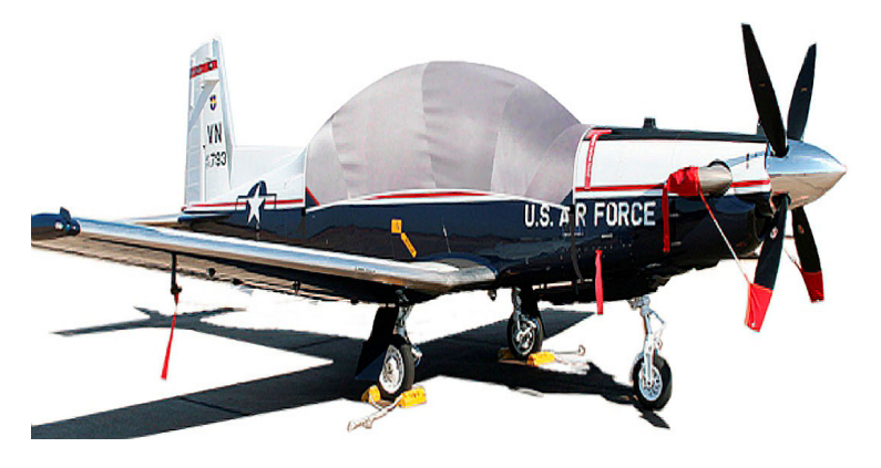
Pilatus PC-7 Canopy Cover