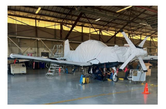
Beech T-6A Texan 2 Complete Hail Protection Cover Set

WINTER USE MATERIAL - Made with Solution-Dyed Polyester fabric, this option is intended for seasonal use to aid in deicing, rain mitigation, or for occasional travel. The material is lighter and more compact, but more susceptible to UV damage and may have a shorter useful life if used continuously outside than the all-year use material.