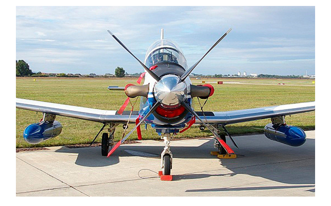
Texan II T6A Engine Inlet Plug, Prop Tie/Exhaust Covers

necessary. Engine plugs have warning flags that are visible from the cockpit or 'remove before flight' streamers sewn onto the face of the plugs. Most plugs are imprinted with the aircraft registration number in black for an extra charge. Storage bag NOT included. Engine plugs may be inserted after flight when the engine is still warm. Engine Inlet Plugs are commonly referred to as Cowl Plugs, Intake Plugs, Cowl Blocks, Engine Blocks, and Engine Bungs.