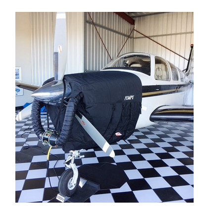
Beech Bonanza 36 Models Insulated Engine Cover

This cover type is made from Silver Acrylic Sunbrella canvas and is 100% lined with a soft and smooth microfiber. Bruce's Custom Covers developed this material combination especially for aircraft protection. The outer material is medium weight and treated for water resistance, UV resistance and anti-static buildup. The inner lining is a very soft and smooth microfiber to prevent scratching. The material is very reflective, and tests show that the cabin interior temperature can be reduced to near-ambient temperature on the hottest of days. It is water, ice and snow repellent, yet breathable to allow moisture to escape from between the cover and the aircraft surface.