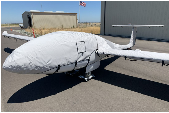
Pipistrel Taurus & Electro Canopy/Nose Cover, All Year Use