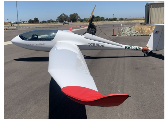
Pipistrel Taurus & Electro Wingtip Pads