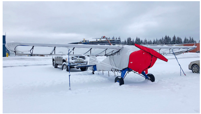
Taylorcraft Aviation Corp F19 Insulated Engine Cover