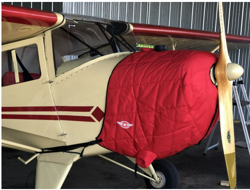
Taylorcraft Insulated Engine Cover

This cover type is made from Silver Acrylic Sunbrella canvas and is 100% lined with a soft and smooth microfiber. Bruce's Custom Covers developed this material combination especially for aircraft protection. The outer material is medium weight and treated for water resistance, UV resistance and anti-static buildup. The inner lining is a very soft and smooth microfiber to prevent scratching. The material is very reflective, and tests show that the cabin interior temperature can be reduced to near-ambient temperature on the hottest of days. It is water, ice and snow repellent, yet breathable to allow moisture to escape from between the cover and the aircraft surface.