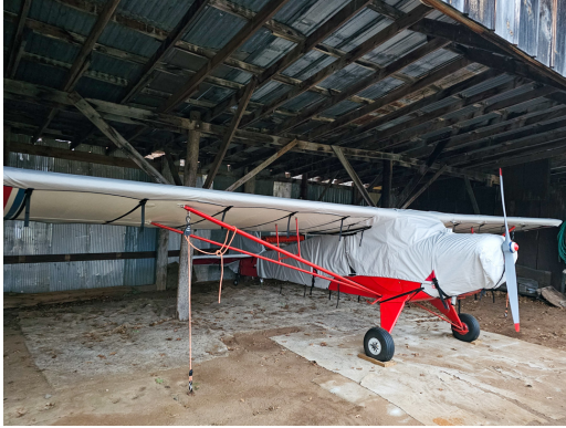
Taylorcraft BC12-D Wing Covers, All Year Use

WINTER USE MATERIAL - Made with Solution-Dyed Polyester fabric, this option is intended for seasonal use to aid in deicing, rain mitigation, or for occasional travel. The material is lighter and more compact, but more susceptible to UV damage and may have a shorter useful life if used continuously outside than the all-year use material.