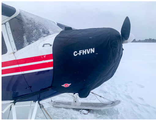
Taylorcraft Models B & F Insulated Engine Cover

This cover type is made from Silver Acrylic Sunbrella canvas and is 100% lined with a soft and smooth microfiber. Bruce's Custom Covers developed this material combination especially for aircraft protection. The outer material is medium weight and treated for water resistance, UV resistance and anti-static buildup. The inner lining is a very soft and smooth microfiber to prevent scratching. The material is very reflective, and tests show that the cabin interior temperature can be reduced to near-ambient temperature on the hottest of days. It is water, ice and snow repellent, yet breathable to allow moisture to escape from between the cover and the aircraft surface.