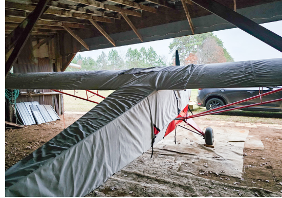
Taylorcraft BC12-D Empennage Cover (Tailboom, Vertical & Horiz Stabilizers) All Year Use