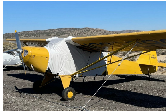
Taylorcraft BC-12D Extended Canopy Cover