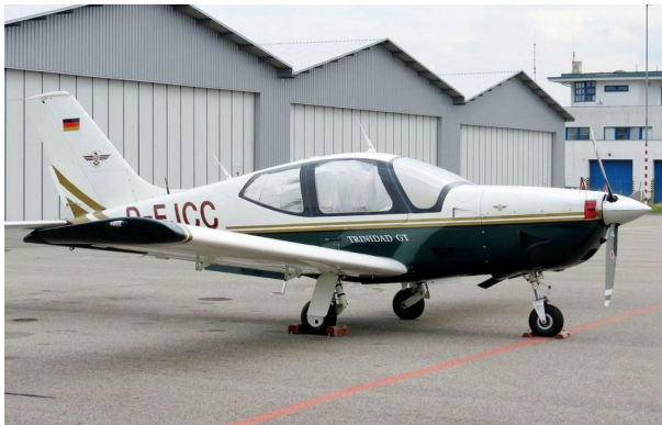
Socata Tobago TB20 Heatshields

Windshield Heatshields are interior sunshades for an aircraft's front windshield. The product is a unique composite of closed-cell foam with a silver mylar finish. The semi-rigid design is stiff enough to stand along the inside of the windshield using sun visors or window framing. It folds up flat and easily stores in the included storage sleeve. Some designs may require velcro and suction cups or split right and left sides. A Heatshield is an excellent short-term remedy for cockpit overheating. An external fabric cover is far more effective and practical for long-term protection.