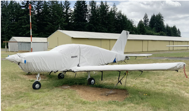
Socata Tampico TB-9C Cover Set