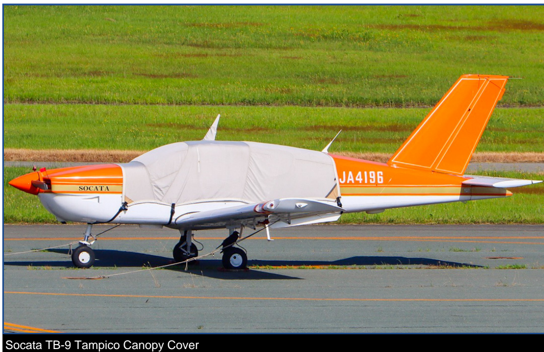
Socata TB-9 Tampico Canopy Cover