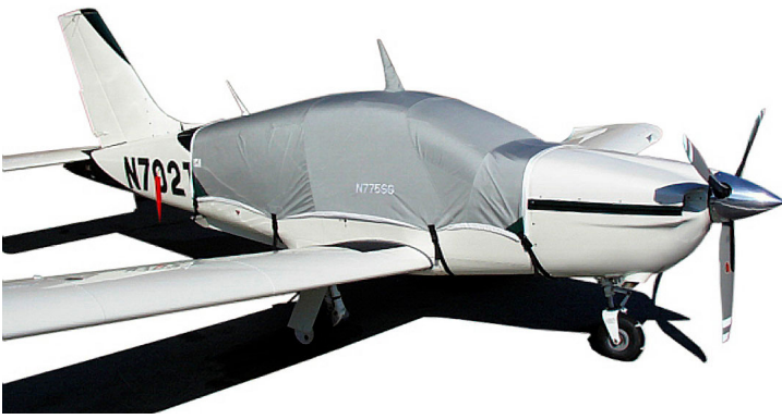
TB20 Standard Canopy Cover