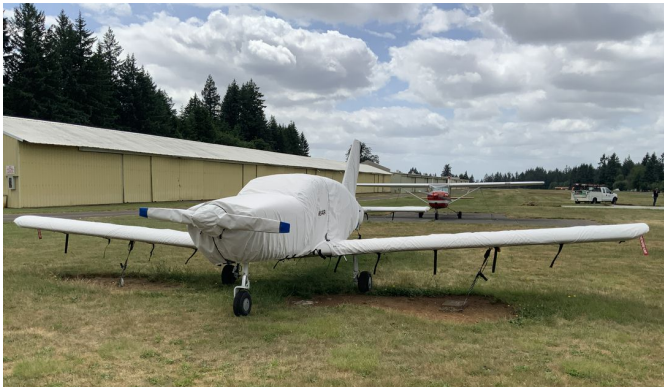
Socata Tampico TB-9C Cover Set

This cover type is made from Silver Acrylic Sunbrella canvas and is 100% lined with a soft and smooth microfiber. Bruce's Custom Covers developed this material combination especially for aircraft protection. The outer material is medium weight and treated for water resistance, UV resistance and anti-static buildup. The inner lining is a very soft and smooth microfiber to prevent scratching. The material is very reflective, and tests show that the cabin interior temperature can be reduced to near-ambient temperature on the hottest of days. It is water, ice and snow repellent, yet breathable to allow moisture to escape from between the cover and the aircraft surface.