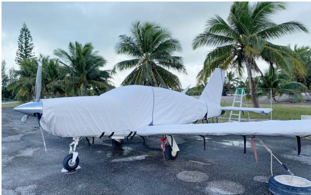
Socata Trinidad Full Cover Set