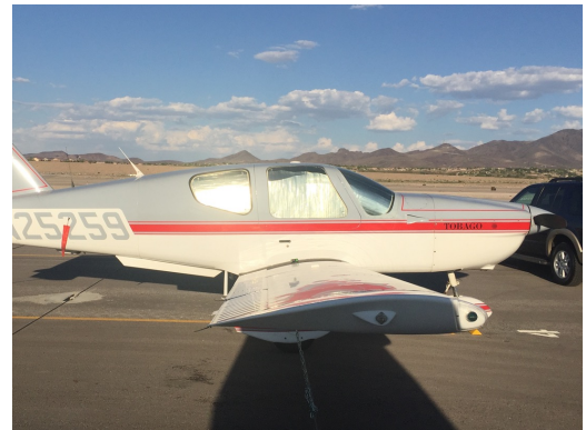
Socata TB-10 Cabin HeatShields