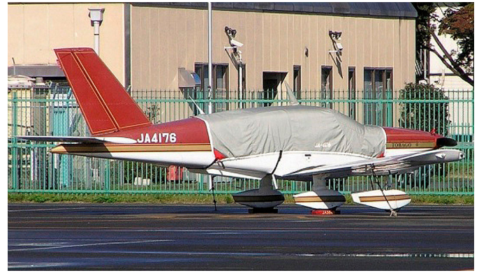
Socata TB-10 Tampico Canopy Cover