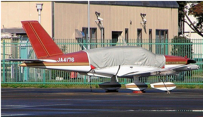
Socata TB-10 Tampico Canopy Cover

This cover type is made from Silver Acrylic Sunbrella canvas and is 100% lined with a soft and smooth microfiber. Bruce's Custom Covers developed this material combination especially for aircraft protection. The outer material is medium weight and treated for water resistance, UV resistance and anti-static buildup. The inner lining is a very soft and smooth microfiber to prevent scratching. The material is very reflective, and tests show that the cabin interior temperature can be reduced to near-ambient temperature on the hottest of days. It is water, ice and snow repellent, yet breathable to allow moisture to escape from between the cover and the aircraft surface.