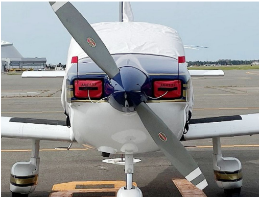
Socata TB10 Engine Plugs