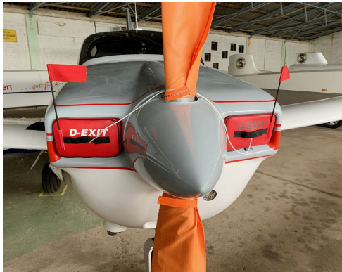
Socata TB-20 Engine Plugs

Engine Inlet Plugs are custom fit for your Socata TB9-GT, Tobago: TB10-GT & TB200-GT, Trinidad: TB20-GT, TB21-GT intakes, made with heavy-duty vinyl material, and stuffed with a single block of sculpted urethane foam. Each plug has a zipper that allows the foam to be removed and dried if necessary. Engine plugs have warning flags that are visible from the cockpit or 'remove before flight' streamers sewn onto the face of the plugs. Most plugs are imprinted with the aircraft registration number in black for an extra charge. Storage bag NOT included. Engine plugs may be inserted after flight when the engine is still warm. Engine Inlet Plugs are commonly referred to as Cowl Plugs, Intake Plugs, Cowl Blocks, Engine Blocks, and Engine Bungs.