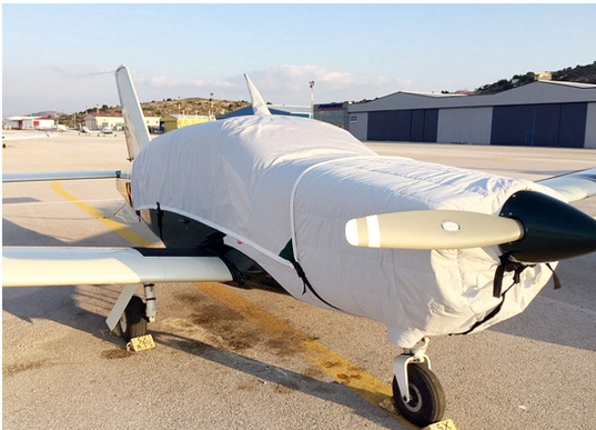
Socata TB-20 Canopy Cover, Insulated Engine Cover