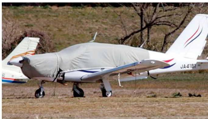
Canopy & Engine Covers

This cover type is made from Silver Acrylic Sunbrella canvas and is 100% lined with a soft and smooth microfiber. Bruce's Custom Covers developed this material combination especially for aircraft protection. The outer material is medium weight and treated for water resistance, UV resistance and anti-static buildup. The inner lining is a very soft and smooth microfiber to prevent scratching. The material is very reflective, and tests show that the cabin interior temperature can be reduced to near-ambient temperature on the hottest of days. It is water, ice and snow repellent, yet breathable to allow moisture to escape from between the cover and the aircraft surface.