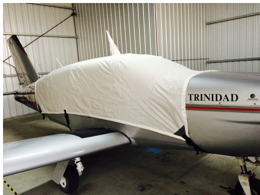
Trinidad Canopy Cover

This cover type is made from Silver Acrylic Sunbrella canvas and is 100% lined with a soft and smooth microfiber. Bruce's Custom Covers developed this material combination especially for aircraft protection. The outer material is medium weight and treated for water resistance, UV resistance and anti-static buildup. The inner lining is a very soft and smooth microfiber to prevent scratching. The material is very reflective, and tests show that the cabin interior temperature can be reduced to near-ambient temperature on the hottest of days. It is water, ice and snow repellent, yet breathable to allow moisture to escape from between the cover and the aircraft surface.