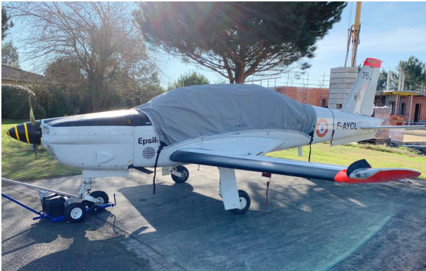
Socata TB-30 Epsilon Travel Cover, Light Weight Canopy Cover

Travel Covers are made with Silver Solution-Dyed Polyester fabric and only lined over the windshield to save weight. The material is lightweight and more compact for easy stowage in the aircraft. The polyester material is water resistant, but only intended for occasional use outside. We also have an ultra lightweight material available for fitted hangar dust covers. For daily outdoor use, the non-travel Sunbrella Cover is the best choice.