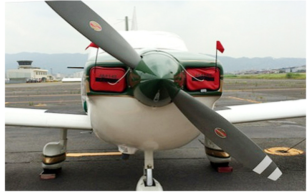
Socata TB-20 Engine Plugs