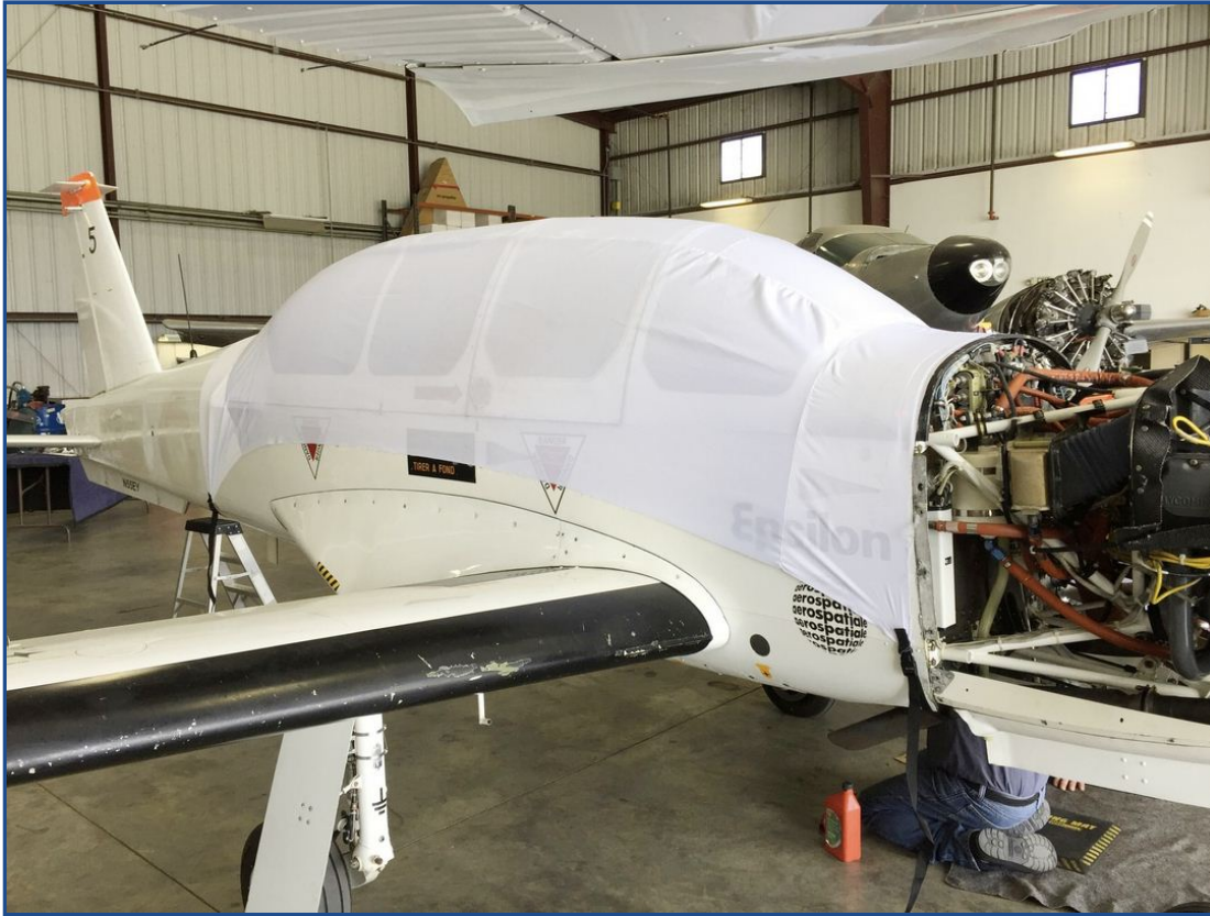
Socata TB30 Epsilon Canopy Cover, test fit cover