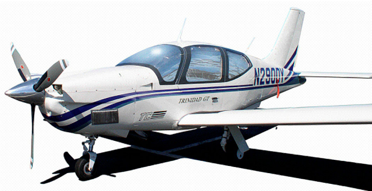
Socata TB20 HeatShields

Windshield Heatshields are interior sunshades for an aircraft's front windshield. The product is a unique composite of closed-cell foam with a silver mylar finish. The semi-rigid design is stiff enough to stand along the inside of the windshield using sun visors or window framing. It folds up flat and easily stores in the included storage sleeve. Some designs may require velcro and suction cups or split right and left sides. A Heatshield is an excellent short-term remedy for cockpit overheating. An external fabric cover is far more effective and practical for long-term protection.