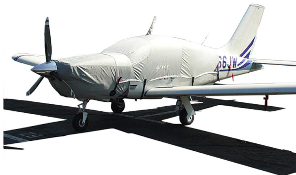
Canopy Cover & Engine Cover