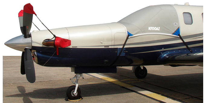
TBM700 Cockpit Cover, Engine Plugs, Prop Tie/Exhaust Covers