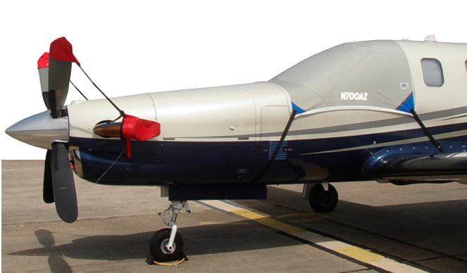
Socata TBM 700, 750, 850, 900, 910, 930, 940, 960 Prop Tie/Exhaust Covers, Heat Resistant Type (Specify Model Number) TBM700 Cockpit Cover, Engine Plugs, Prop Tie/Exhaust Covers