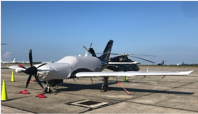
Socata TBM Canopy, Engine, Wing & Horizontal Stabilizer Covers

This cover type is made from Silver Acrylic Sunbrella canvas and is 100% lined with a soft and smooth microfiber. Bruce's Custom Covers developed this material combination especially for aircraft protection. The outer material is medium weight and treated for water resistance, UV resistance and anti-static buildup. The inner lining is a very soft and smooth microfiber to prevent scratching. The material is very reflective, and tests show that the cabin interior temperature can be reduced to near-ambient temperature on the hottest of days. It is water, ice and snow repellent, yet breathable to allow moisture to escape from between the cover and the aircraft surface.