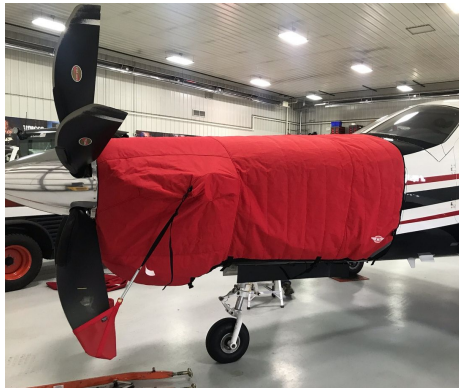
Socata TBM Insulated Engine Cover

This cover type is made from Silver Acrylic Sunbrella canvas and is 100% lined with a soft and smooth microfiber. Bruce's Custom Covers developed this material combination especially for aircraft protection. The outer material is medium weight and treated for water resistance, UV resistance and anti-static buildup. The inner lining is a very soft and smooth microfiber to prevent scratching. The material is very reflective, and tests show that the cabin interior temperature can be reduced to near-ambient temperature on the hottest of days. It is water, ice and snow repellent, yet breathable to allow moisture to escape from between the cover and the aircraft surface.