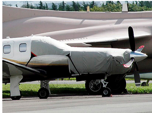
Socata TBM Cockpit Cover, Engine Cover