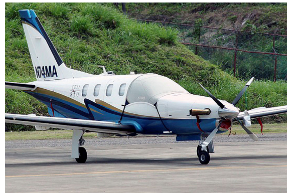
TBM 850 Cockpit Cover