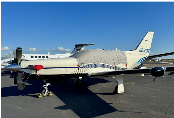
Socata TBM 850 Travel Weight Canopy Cover, Prop Tie/Exhaust Covers

Travel Covers are made with Silver Solution-Dyed Polyester fabric and only lined over the windshield to save weight. The material is lightweight and more compact for easy stowage in the aircraft. The polyester material is water resistant, but only intended for occasional use outside. We also have an ultra lightweight material available for fitted hangar dust covers. For daily outdoor use, the non-travel Sunbrella Cover is the best choice.