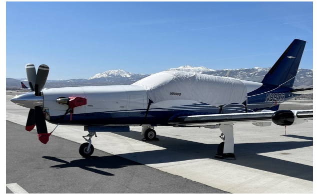
Socata TBM Canopy Cover