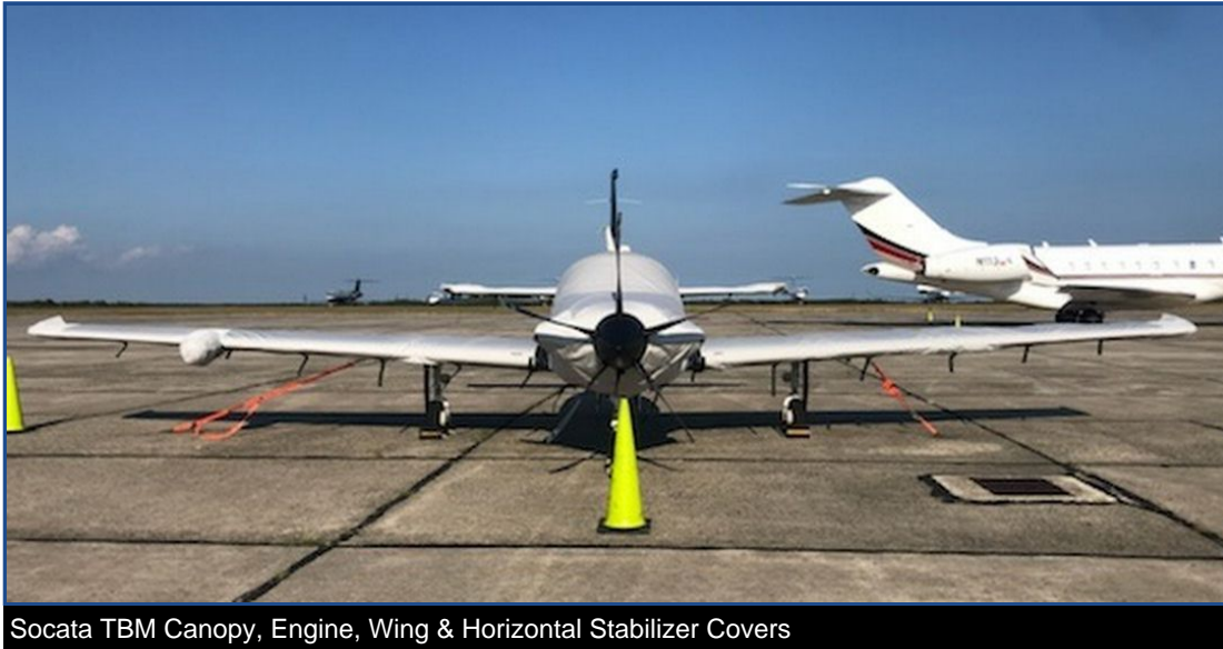
Socata TBM Canopy, Engine, Wing & Horizontal Stabilizer Covers