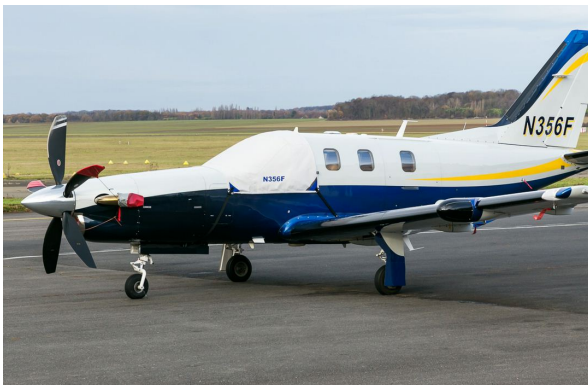
Socata TBM 700 Cockpit Cover (Not Bruce's Prop/Exhaust)

Travel Covers are made with Silver Solution-Dyed Polyester fabric and only lined over the windshield to save weight. The material is lightweight and more compact for easy stowage in the aircraft. The polyester material is water resistant, but only intended for occasional use outside. We also have an ultra lightweight material available for fitted hangar dust covers. For daily outdoor use, the non-travel Sunbrella Cover is the best choice.