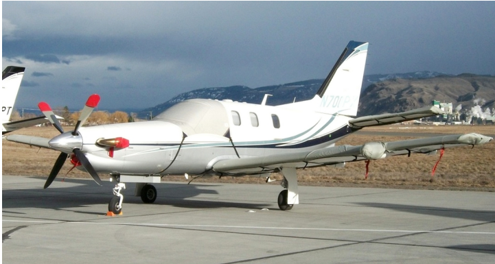
Socata TBM Cockpit, Wings, Horizontal Stab. Covers

This cover type is made from Silver Acrylic Sunbrella canvas and is 100% lined with a soft and smooth microfiber. Bruce's Custom Covers developed this material combination especially for aircraft protection. The outer material is medium weight and treated for water resistance, UV resistance and anti-static buildup. The inner lining is a very soft and smooth microfiber to prevent scratching. The material is very reflective, and tests show that the cabin interior temperature can be reduced to near-ambient temperature on the hottest of days. It is water, ice and snow repellent, yet breathable to allow moisture to escape from between the cover and the aircraft surface.