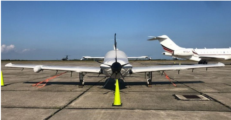
Socata TBM Canopy, Engine, Wing & Horizontal Stabilizer Covers

WINTER USE MATERIAL - Made with Solution-Dyed Polyester fabric, this option is intended for seasonal use to aid in deicing, rain mitigation, or for occasional travel. The material is lighter and more compact, but more susceptible to UV damage and may have a shorter useful life if used continuously outside than the all-year use material.