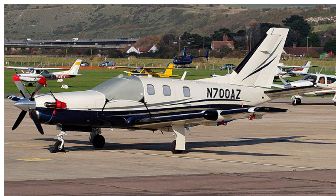
TBM 700 Cockpit Cover, Prop Tie-down/Exhaust Covers, & Engine Inlet Plugs