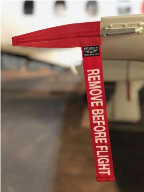
TBM-900 Static Wick Protector