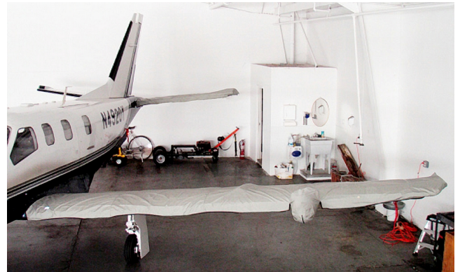
Socata TBM 700, 850 Wing and Horizontal Stabilizer Covers