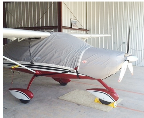
Tecnam P2008 Canopy Cover & Light Weight Engine Cover