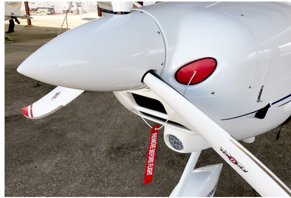
Tecnam P2008 Engine Inlet Plugs