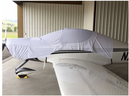
Tecnam Astore Canopy/Engine Cover, test fit cover