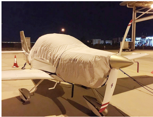
Tecnam Astore Canopy & Engine Covers

This cover type is made from Silver Acrylic Sunbrella canvas and is 100% lined with a soft and smooth microfiber. Bruce's Custom Covers developed this material combination especially for aircraft protection. The outer material is medium weight and treated for water resistance, UV resistance and anti-static buildup. The inner lining is a very soft and smooth microfiber to prevent scratching. The material is very reflective, and tests show that the cabin interior temperature can be reduced to near-ambient temperature on the hottest of days. It is water, ice and snow repellent, yet breathable to allow moisture to escape from between the cover and the aircraft surface.