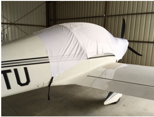
Tecnam Astore Canopy/Engine Cover, test fit cover

Travel Covers are made with Silver Solution-Dyed Polyester fabric and only lined over the windshield to save weight. The material is lightweight and more compact for easy stowage in the aircraft. The polyester material is water resistant, but only intended for occasional use outside. We also have an ultra lightweight material available for fitted hangar dust covers. For daily outdoor use, the non-travel Sunbrella Cover is the best choice.