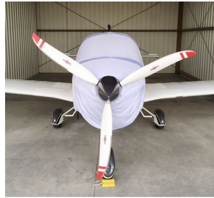
Tecnam Astore Canopy/Engine Cover, test fit cover