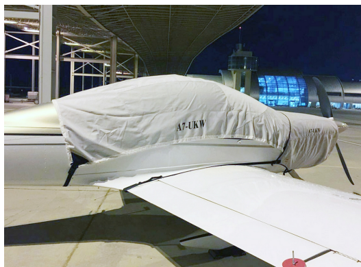
Tecnam Astore Canopy & Engine Covers

This cover type is made from Silver Acrylic Sunbrella canvas and is 100% lined with a soft and smooth microfiber. Bruce's Custom Covers developed this material combination especially for aircraft protection. The outer material is medium weight and treated for water resistance, UV resistance and anti-static buildup. The inner lining is a very soft and smooth microfiber to prevent scratching. The material is very reflective, and tests show that the cabin interior temperature can be reduced to near-ambient temperature on the hottest of days. It is water, ice and snow repellent, yet breathable to allow moisture to escape from between the cover and the aircraft surface.