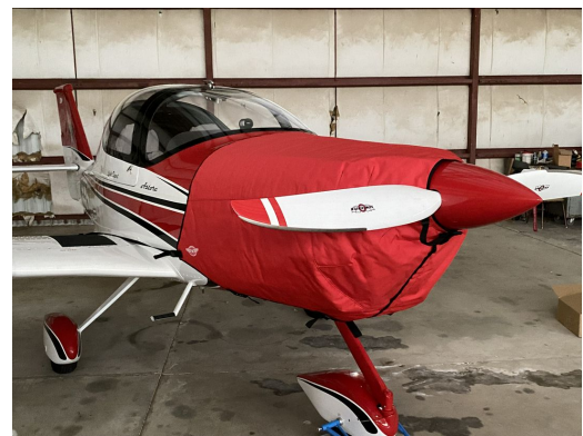
Tecnam Astore Insulated Engine Cover