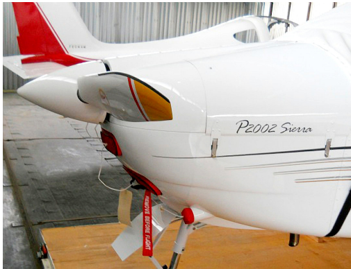
Tecnam Sierra Engine Inlet Plugs set

Engine Inlet Plugs are custom fit for your Tecnam Astore intakes, made with heavy-duty vinyl material, and stuffed with a single block of sculpted urethane foam. Each plug has a zipper that allows the foam to be removed and dried if necessary. Engine plugs have warning flags that are visible from the cockpit or 'remove before flight' streamers sewn onto the face of the plugs. Most plugs are imprinted with the aircraft registration number in black for an extra charge. Storage bag NOT included. Engine plugs may be inserted after flight when the engine is still warm. Engine Inlet Plugs are commonly referred to as Cowl Plugs, Intake Plugs, Cowl Blocks, Engine Blocks, and Engine Bungs.