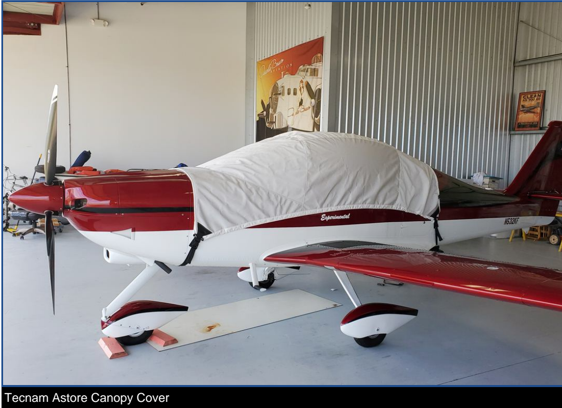
Tecnam Astore Canopy Cover