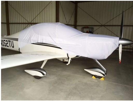
Tecnam Astore Canopy/Engine Cover, test fit cover

Travel Covers are made with Silver Solution-Dyed Polyester fabric and only lined over the windshield to save weight. The material is lightweight and more compact for easy stowage in the aircraft. The polyester material is water resistant, but only intended for occasional use outside. We also have an ultra lightweight material available for fitted hangar dust covers. For daily outdoor use, the non-travel Sunbrella Cover is the best choice.