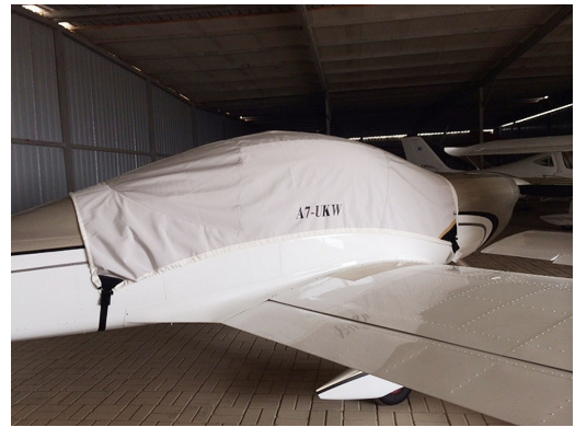
Tecnam Astore Canopy Cover