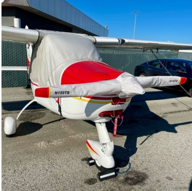
Tecnam Bravo Canopy & Prop Covers, Engine Plugs

This cover type is made from Silver Acrylic Sunbrella canvas and is 100% lined with a soft and smooth microfiber. Bruce's Custom Covers developed this material combination especially for aircraft protection. The outer material is medium weight and treated for water resistance, UV resistance and anti-static buildup. The inner lining is a very soft and smooth microfiber to prevent scratching. The material is very reflective, and tests show that the cabin interior temperature can be reduced to near-ambient temperature on the hottest of days. It is water, ice and snow repellent, yet breathable to allow moisture to escape from between the cover and the aircraft surface.