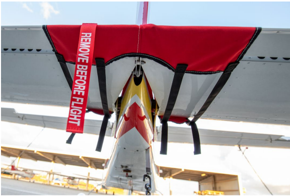
Tecnam Bravo Tailcone Cover

WINTER USE MATERIAL - Made with Solution-Dyed Polyester fabric, this option is intended for seasonal use to aid in deicing, rain mitigation, or for occasional travel. The material is lighter and more compact, but more susceptible to UV damage and may have a shorter useful life if used continuously outside than the all-year use material.