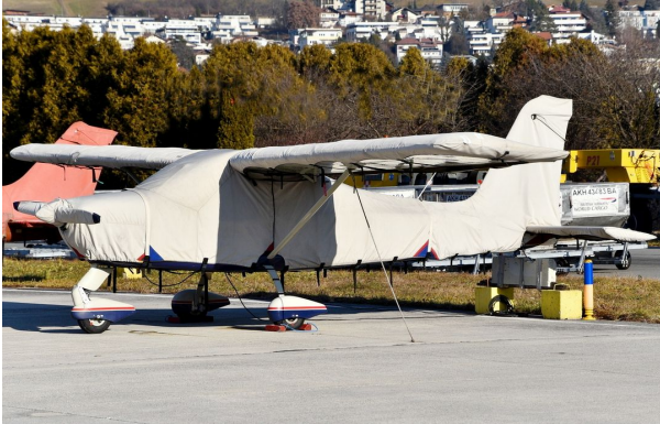
Tecnam P92 Echo Complete Cover Set

This cover type is made from Silver Acrylic Sunbrella canvas and is 100% lined with a soft and smooth microfiber. Bruce's Custom Covers developed this material combination especially for aircraft protection. The outer material is medium weight and treated for water resistance, UV resistance and anti-static buildup. The inner lining is a very soft and smooth microfiber to prevent scratching. The material is very reflective, and tests show that the cabin interior temperature can be reduced to near-ambient temperature on the hottest of days. It is water, ice and snow repellent, yet breathable to allow moisture to escape from between the cover and the aircraft surface.