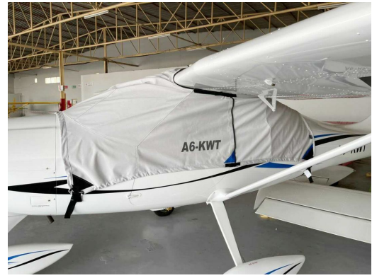
Tecnam P92 Echo Super Canopy Cover, Wrap-Around