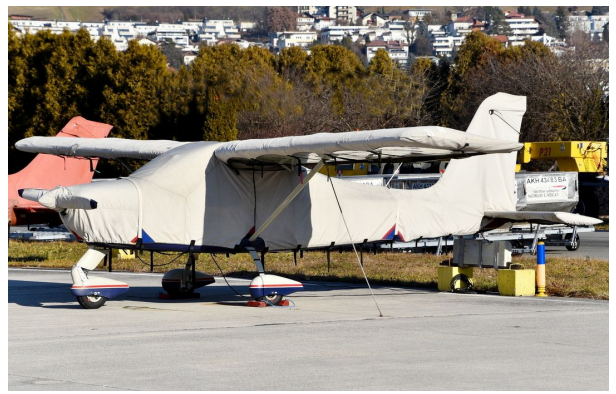
Tecnam P92 Echo Complete Cover Set