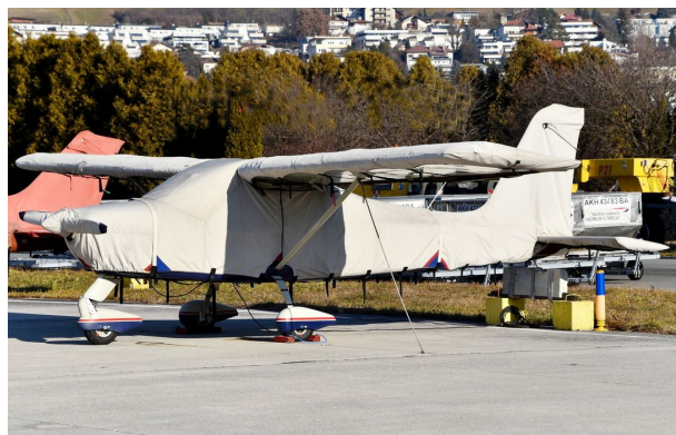
Tecnam P92 Echo Complete Cover Set

WINTER USE MATERIAL - Made with Solution-Dyed Polyester fabric, this option is intended for seasonal use to aid in deicing, rain mitigation, or for occasional travel. The material is lighter and more compact, but more susceptible to UV damage and may have a shorter useful life if used continuously outside than the all-year use material.