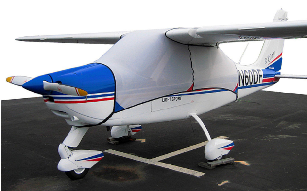
Tecnam Bravo Spandex FlyAway Travel Canopy Cover

Travel Covers are made with Silver Solution-Dyed Polyester fabric and only lined over the windshield to save weight. The material is lightweight and more compact for easy stowage in the aircraft. The polyester material is water resistant, but only intended for occasional use outside. We also have an ultra lightweight material available for fitted hangar dust covers. For daily outdoor use, the non-travel Sunbrella Cover is the best choice.