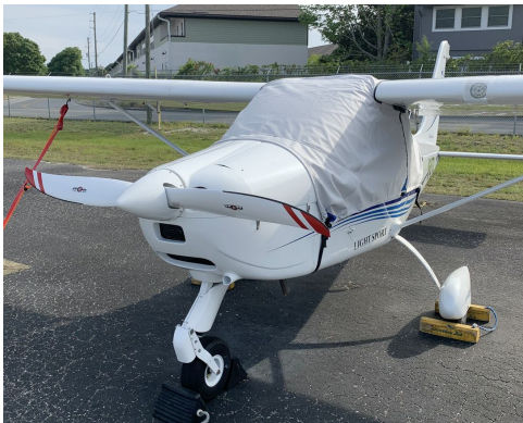
Tecnam P92 EAGLET Canopy Cover Over theTop Style