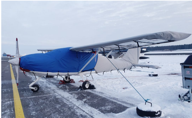
Tecnam P2010 Wing, Empennage & Prop Covers