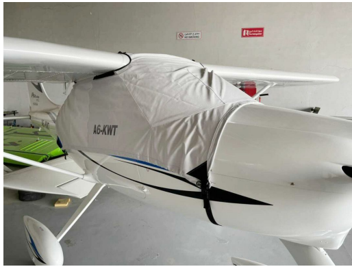
Tecnam P92 Echo Super Canopy Cover, Wrap-Around