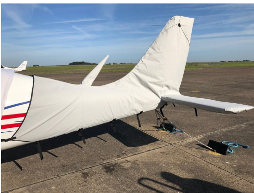
Tecnam P2008 Empennage Cover (Tailboom, Vertical & Horiz Stabilizers), All Year Use