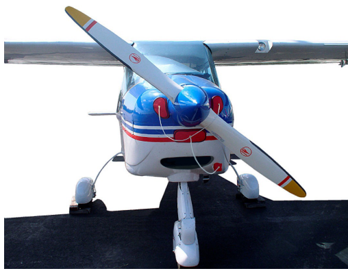
Tecnam Bravo Engine Plugs