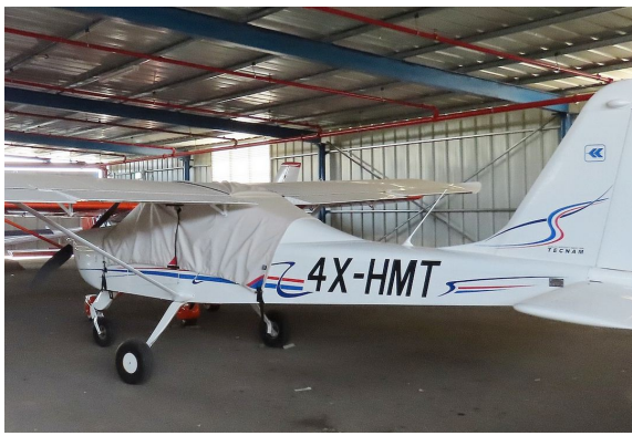
Tecnam Echo Over-Top Canopy Cover