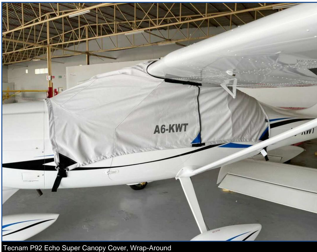
Tecnam P92 Echo Super Canopy Cover, Wrap-Around