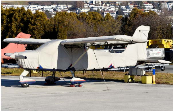
Tecnam P92 Echo Complete Cover Set

This cover type is made from Silver Acrylic Sunbrella canvas and is 100% lined with a soft and smooth microfiber. Bruce's Custom Covers developed this material combination especially for aircraft protection. The outer material is medium weight and treated for water resistance, UV resistance and anti-static buildup. The inner lining is a very soft and smooth microfiber to prevent scratching. The material is very reflective, and tests show that the cabin interior temperature can be reduced to near-ambient temperature on the hottest of days. It is water, ice and snow repellent, yet breathable to allow moisture to escape from between the cover and the aircraft surface.