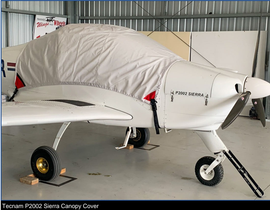
Tecnam P2002 Sierra Canopy Cover