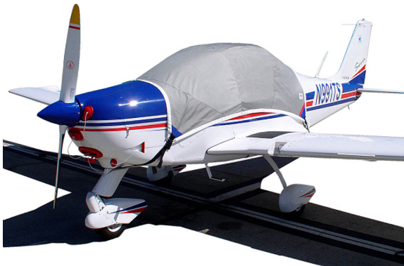
Tecnam Sierra Canopy Cover & Engine Plugs

This cover type is made from Silver Acrylic Sunbrella canvas and is 100% lined with a soft and smooth microfiber. Bruce's Custom Covers developed this material combination especially for aircraft protection. The outer material is medium weight and treated for water resistance, UV resistance and anti-static buildup. The inner lining is a very soft and smooth microfiber to prevent scratching. The material is very reflective, and tests show that the cabin interior temperature can be reduced to near-ambient temperature on the hottest of days. It is water, ice and snow repellent, yet breathable to allow moisture to escape from between the cover and the aircraft surface.