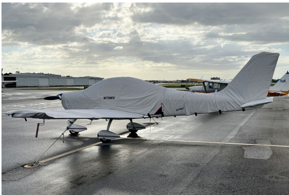
Tecnam P2002 Sierra Complete Cover Set

WINTER USE MATERIAL - Made with Solution-Dyed Polyester fabric, this option is intended for seasonal use to aid in deicing, rain mitigation, or for occasional travel. The material is lighter and more compact, but more susceptible to UV damage and may have a shorter useful life if used continuously outside than the all-year use material.