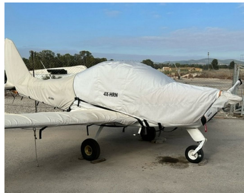
Tecnam Sierra Complete Cover Set