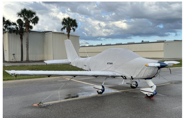
Tecnam P2002 Sierra Complete Cover Set