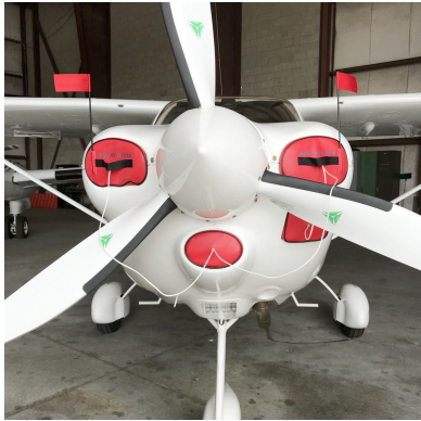
Tecnam P2010 Engine Plugs

Engine Inlet Plugs are custom fit for your Tecnam P2002 Sierra, P96 Golf, P-Mentor intakes, made with heavy-duty vinyl material, and stuffed with a single block of sculpted urethane foam. Each plug has a zipper that allows the foam to be removed and dried if necessary. Engine plugs have warning flags that are visible from the cockpit or 'remove before flight' streamers sewn onto the face of the plugs. Most plugs are imprinted with the aircraft registration number in black for an extra charge. Storage bag NOT included. Engine plugs may be inserted after flight when the engine is still warm. Engine Inlet Plugs are commonly referred to as Cowl Plugs, Intake Plugs, Cowl Blocks, Engine Blocks, and Engine Bungs.