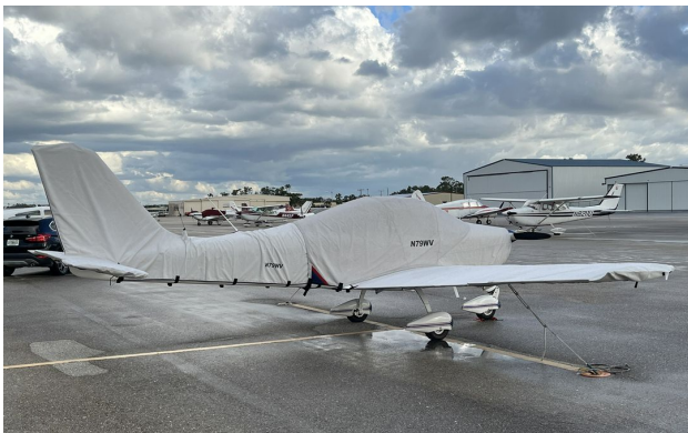
Tecnam P2002 Sierra Complete Cover Set

This cover type is made from Silver Acrylic Sunbrella canvas and is 100% lined with a soft and smooth microfiber. Bruce's Custom Covers developed this material combination especially for aircraft protection. The outer material is medium weight and treated for water resistance, UV resistance and anti-static buildup. The inner lining is a very soft and smooth microfiber to prevent scratching. The material is very reflective, and tests show that the cabin interior temperature can be reduced to near-ambient temperature on the hottest of days. It is water, ice and snow repellent, yet breathable to allow moisture to escape from between the cover and the aircraft surface.