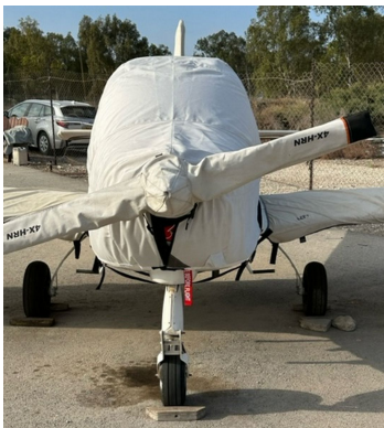
Tecnam Sierra Complete Cover Set

This cover type is made from Silver Acrylic Sunbrella canvas and is 100% lined with a soft and smooth microfiber. Bruce's Custom Covers developed this material combination especially for aircraft protection. The outer material is medium weight and treated for water resistance, UV resistance and anti-static buildup. The inner lining is a very soft and smooth microfiber to prevent scratching. The material is very reflective, and tests show that the cabin interior temperature can be reduced to near-ambient temperature on the hottest of days. It is water, ice and snow repellent, yet breathable to allow moisture to escape from between the cover and the aircraft surface.