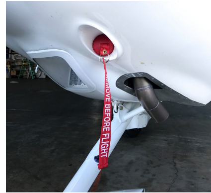
Tecnam Engine Plugs, set of 5