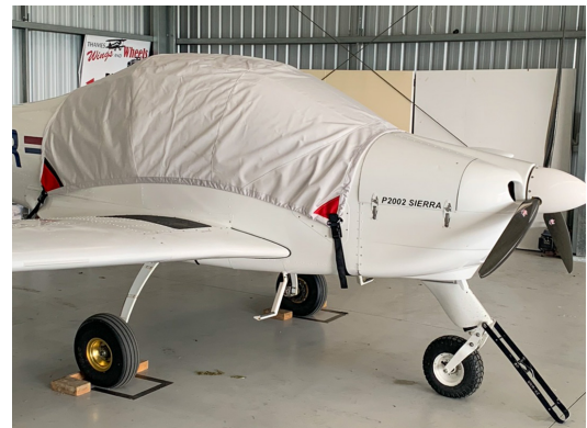
Tecnam P2002 Sierra Canopy Cover