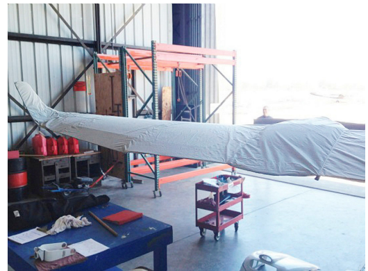
Tecnam Twin Wing/Engine Covers