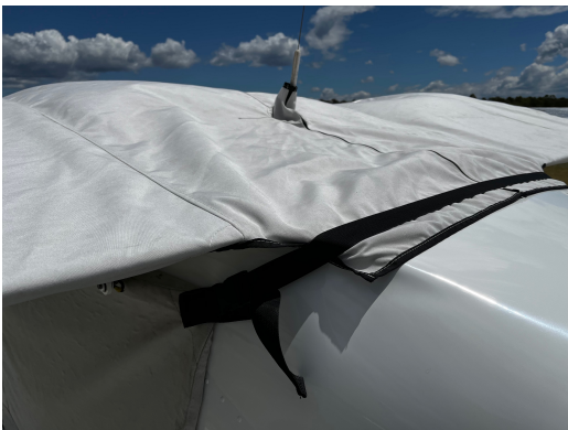
Tecnam P2006T Twin Wing & Engine Covers, All Year Use