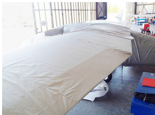
Tecnam Twin Canopy/Nose, Empennage, Wing/Engine, & Propellor/Spinner Covers