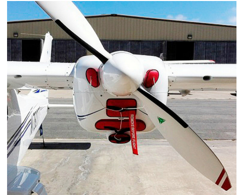
ENGINE PLUGS PREVENT BIRD NEST FOD. Piper Saratoga Engine Cowling Bird's Nest Tecnam P2006T Engine Plugs