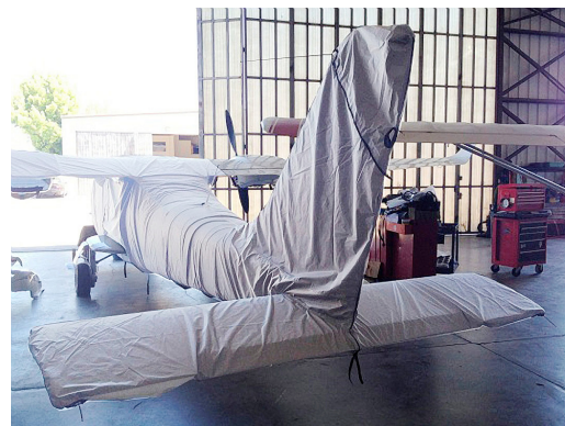
Tecnam Twin Canopy/Nose, Empennage, Wing/Engine, & Propellor/Spinner Covers