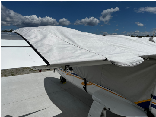
Tecnam P2006T Twin Wing & Engine Covers, All Year Use

WINTER USE MATERIAL - Made with Solution-Dyed Polyester fabric, this option is intended for seasonal use to aid in deicing, rain mitigation, or for occasional travel. The material is lighter and more compact, but more susceptible to UV damage and may have a shorter useful life if used continuously outside than the all-year use material.