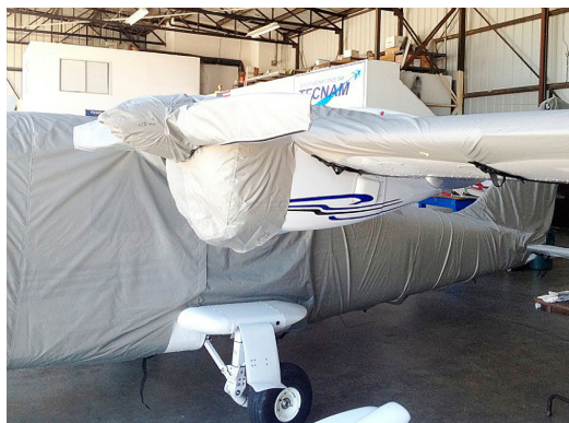
Tecnam Twin Canopy/Nose, Empennage, Wing/Engine, & Propellor/Spinner Covers

This cover type is made from Silver Acrylic Sunbrella canvas and is 100% lined with a soft and smooth microfiber. Bruce's Custom Covers developed this material combination especially for aircraft protection. The outer material is medium weight and treated for water resistance, UV resistance and anti-static buildup. The inner lining is a very soft and smooth microfiber to prevent scratching. The material is very reflective, and tests show that the cabin interior temperature can be reduced to near-ambient temperature on the hottest of days. It is water, ice and snow repellent, yet breathable to allow moisture to escape from between the cover and the aircraft surface.