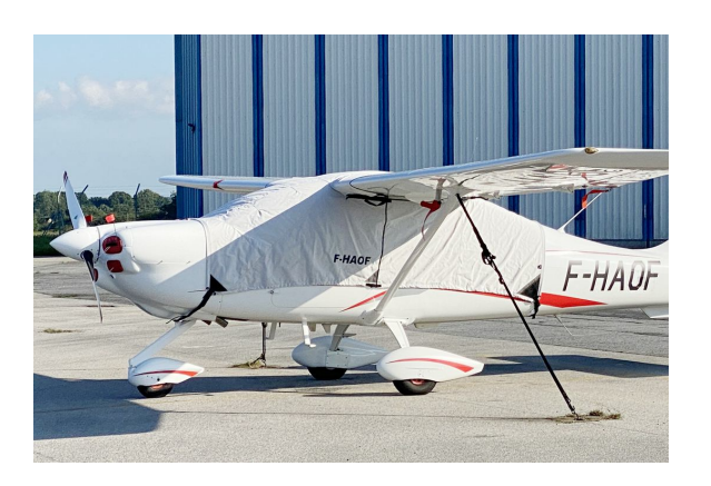
Tecnam P2010 Over-Top Canopy Cover, Engine Plugs