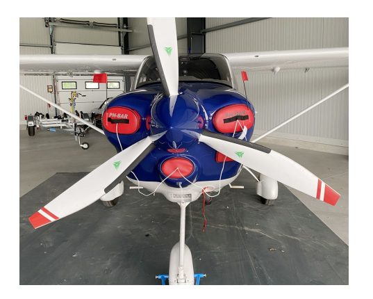
Tecnam P2010 Engine Inlet Plugs