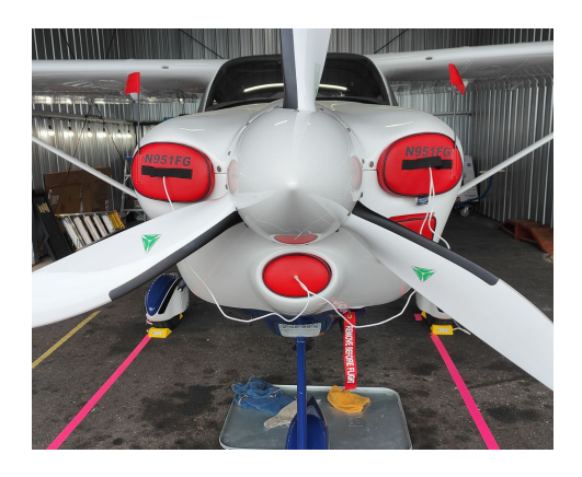
Tecnam P2010 Engine Inlet Plugs