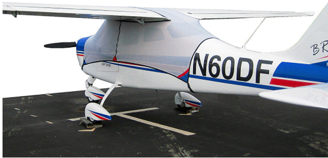
Tecnam Bravo Spandex FlyAway Travel Canopy Cover