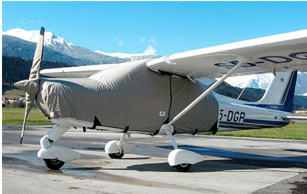
Tecnam Echo Extended Canopy, Engine, Prop Covers