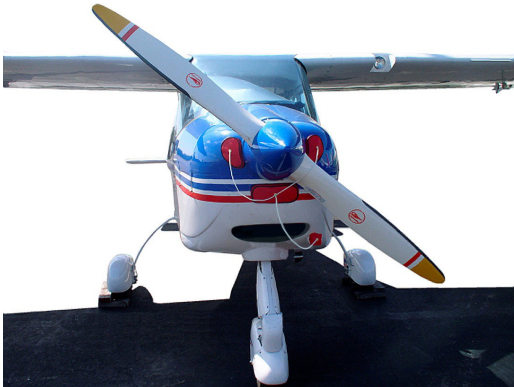
Tecnam Bravo Engine Plugs