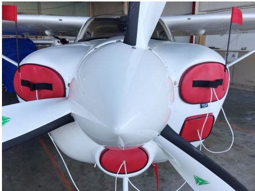
Tecnam Engine Plugs, set of 5

Engine Inlet Plugs are custom fit for your Tecnam P92 Eaglet intakes, made with heavy-duty vinyl material, and stuffed with a single block of sculpted urethane foam. Each plug has a zipper that allows the foam to be removed and dried if necessary. Engine plugs have warning flags that are visible from the cockpit or 'remove before flight' streamers sewn onto the face of the plugs. Most plugs are imprinted with the aircraft registration number in black for an extra charge. Storage bag NOT included. Engine plugs may be inserted after flight when the engine is still warm. Engine Inlet Plugs are commonly referred to as Cowl Plugs, Intake Plugs, Cowl Blocks, Engine Blocks, and Engine Bungs.