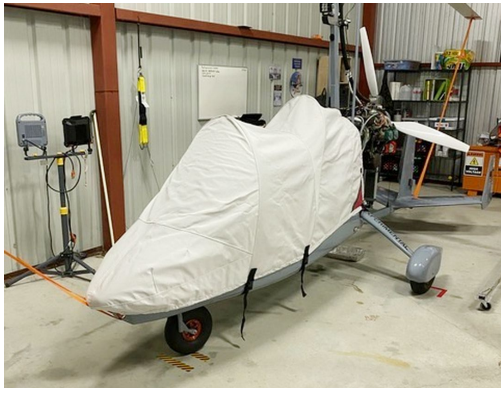
Magni Auto Gyro M16 Cockpit/Nose Cover