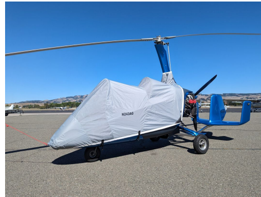
MTO Sport Gyrocopter Canopy/Nose Cover, test fit cover Autogyro MTOSPORT Travel Cover, Light Weight Canopy/Nose Cover