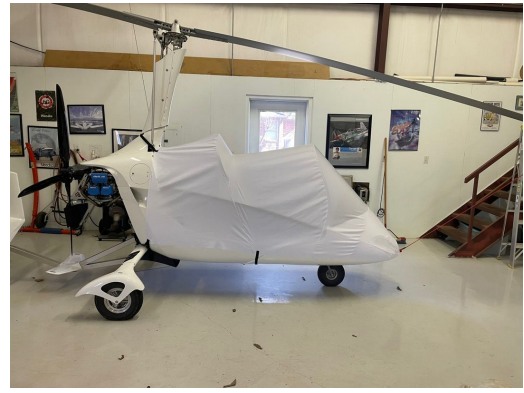
MTO Sport Gyrocopter Canopy/Nose Cover, test fit cover