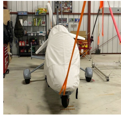
Magni Auto Gyro M16 Cockpit/Nose Cover