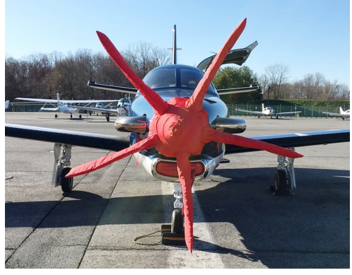
Socata TBM Insulated 5-Blade Prop/Spinner Cover

This cover type is made from Silver Acrylic Sunbrella canvas and is 100% lined with a soft and smooth microfiber. Bruce's Custom Covers developed this material combination especially for aircraft protection. The outer material is medium weight and treated for water resistance, UV resistance and anti-static buildup. The inner lining is a very soft and smooth microfiber to prevent scratching. The material is very reflective, and tests show that the cabin interior temperature can be reduced to near-ambient temperature on the hottest of days. It is water, ice and snow repellent, yet breathable to allow moisture to escape from between the cover and the aircraft surface.