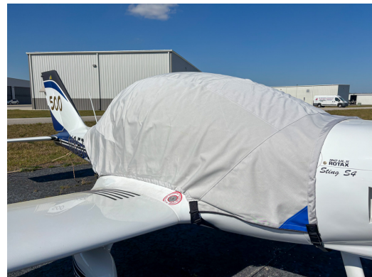
TL Ultralight TL 2000 Sting Sport, 96 Star, S3, S4 Canopy Cover TL Ultralight TL 2000 Sting Sport, 96 Star, S3, S4 Canopy Cover