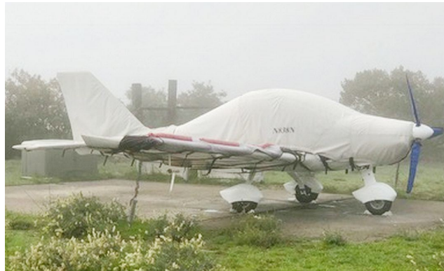
TL Sting Sport Full Cover Set

WINTER USE MATERIAL - Made with Solution-Dyed Polyester fabric, this option is intended for seasonal use to aid in deicing, rain mitigation, or for occasional travel. The material is lighter and more compact, but more susceptible to UV damage and may have a shorter useful life if used continuously outside than the all-year use material.