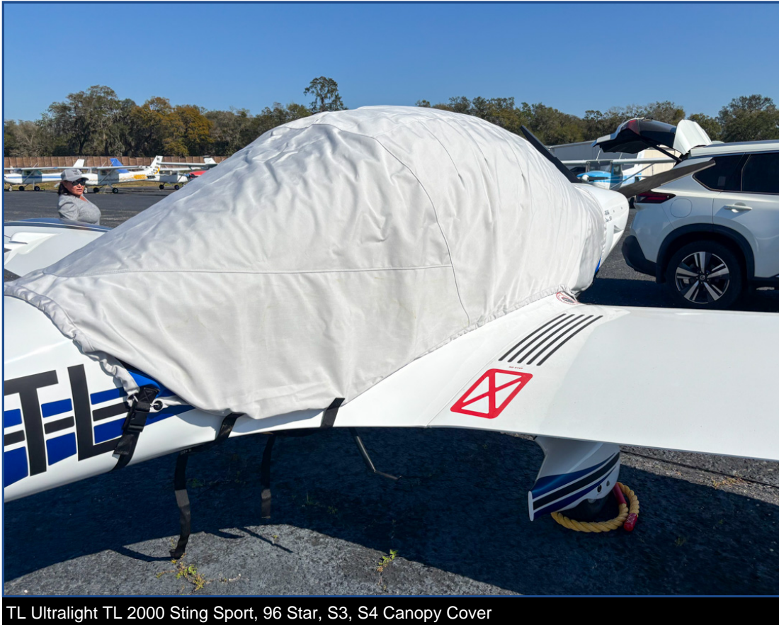
TL Ultralight TL 2000 Sting Sport, 96 Star, S3, S4 Canopy Cover