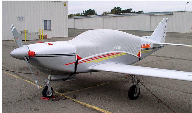
Glasair II/III Canopy Cover & Plugs

This cover type is made from Silver Acrylic Sunbrella canvas and is 100% lined with a soft and smooth microfiber. Bruce's Custom Covers developed this material combination especially for aircraft protection. The outer material is medium weight and treated for water resistance, UV resistance and anti-static buildup. The inner lining is a very soft and smooth microfiber to prevent scratching. The material is very reflective, and tests show that the cabin interior temperature can be reduced to near-ambient temperature on the hottest of days. It is water, ice and snow repellent, yet breathable to allow moisture to escape from between the cover and the aircraft surface.