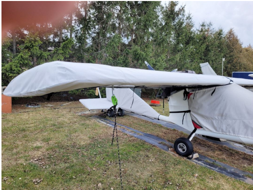
Titan Tornado Canopy/Nose, Wings & Empennage Cover

WINTER USE MATERIAL - Made with Solution-Dyed Polyester fabric, this option is intended for seasonal use to aid in deicing, rain mitigation, or for occasional travel. The material is lighter and more compact, but more susceptible to UV damage and may have a shorter useful life if used continuously outside than the all-year use material.