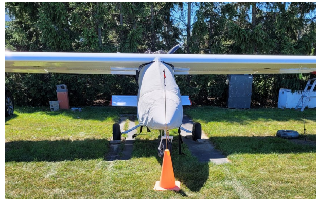
Titan Tornado Canopy/Nose Cover