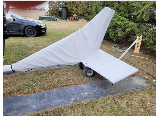
Titan Tornado Empennage Cover