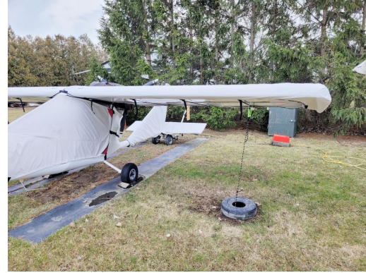
Titan Tornado Canopy/Nose, Wings & Empennage Cover