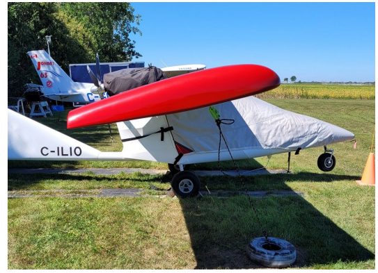
Titan Tornado Canopy/Nose Cover