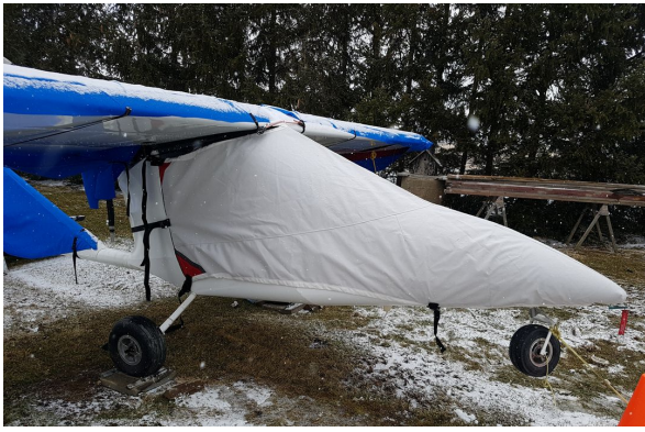
Titan Tornado Canopy/Nose Cover