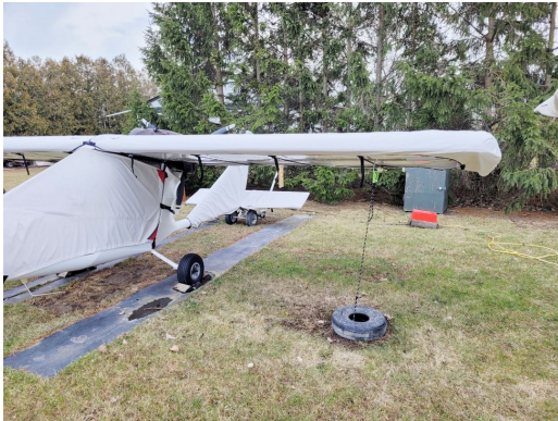
Titan Tornado Canopy/Nose, Wings & Empennage Cover

WINTER USE MATERIAL - Made with Solution-Dyed Polyester fabric, this option is intended for seasonal use to aid in deicing, rain mitigation, or for occasional travel. The material is lighter and more compact, but more susceptible to UV damage and may have a shorter useful life if used continuously outside than the all-year use material.