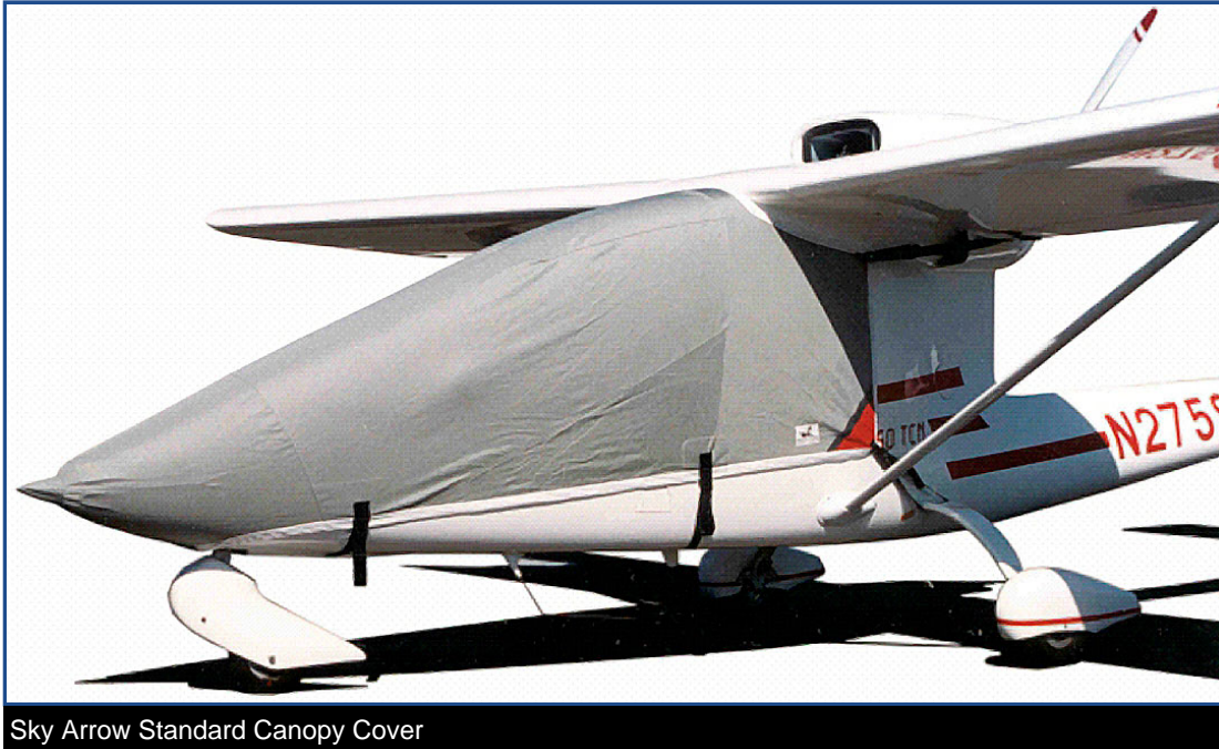
Sky Arrow Standard Canopy Cover