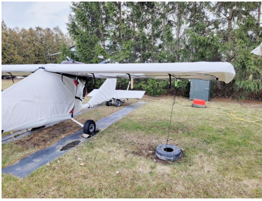
Titan Tornado Canopy/Nose, Wings & Empennage Cover