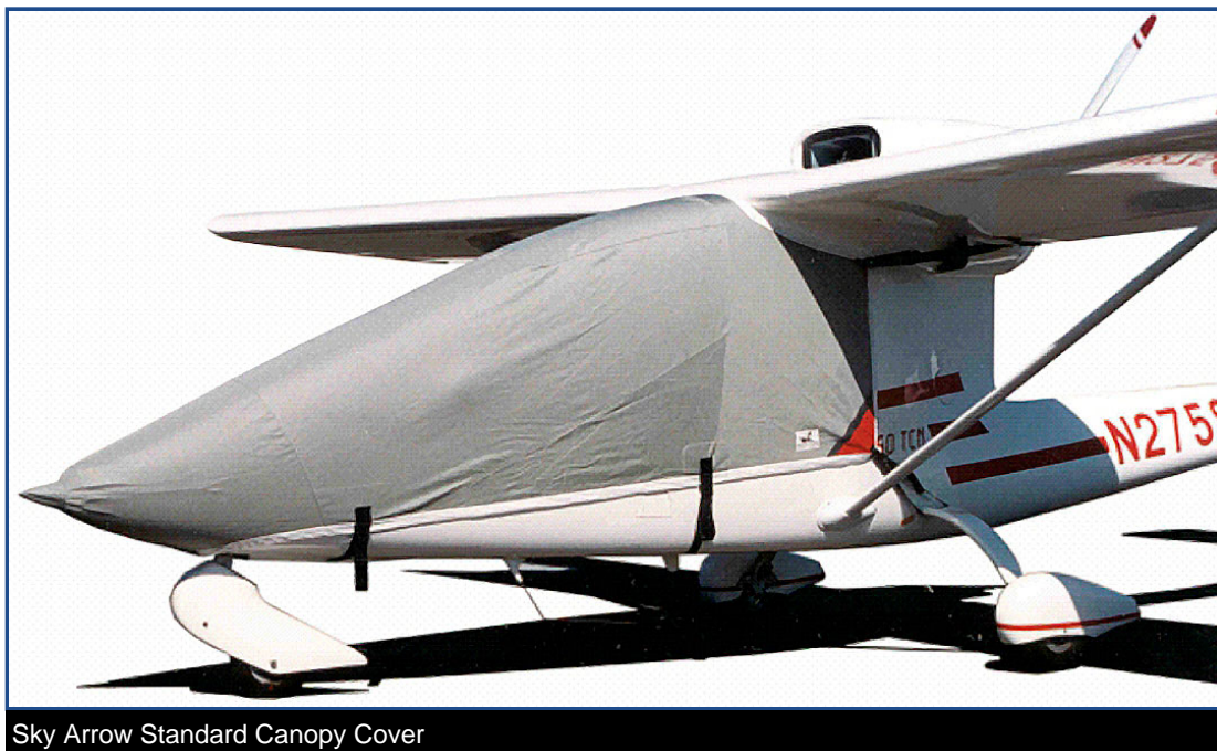
Sky Arrow Standard Canopy Cover