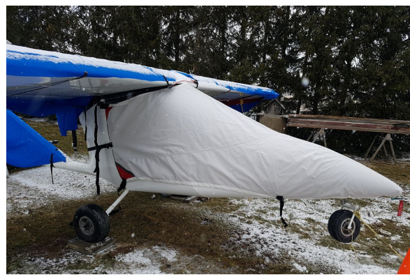
Titan Tornado Canopy/Nose Cover