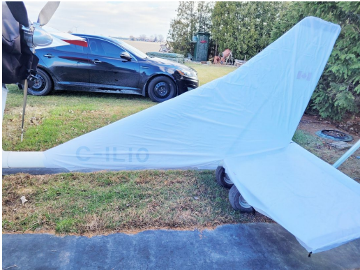
Titan Tornado Empennage Cover, test fit cover