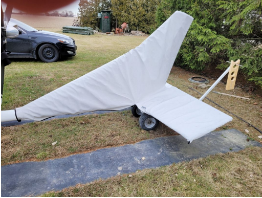
Titan Tornado Empennage Cover

WINTER USE MATERIAL - Made with Solution-Dyed Polyester fabric, this option is intended for seasonal use to aid in deicing, rain mitigation, or for occasional travel. The material is lighter and more compact, but more susceptible to UV damage and may have a shorter useful life if used continuously outside than the all-year use material.