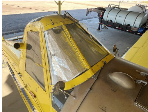
Air Tractor Cockpit HeatShields

foam with a silver mylar finish. The semi-rigid design is stiff enough to stand along the inside of the windshield using sun visors or window framing. It folds up flat and easily stores in the included storage sleeve. Some designs may require velcro and suction cups or split right and left sides. A Heatshield is an excellent short-term remedy for cockpit overheating. An external fabric cover is far more effective and practical for long-term protection.