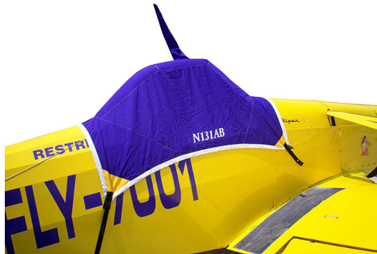
Piper Pawnee Canopy Cover

This cover type is made from Silver Acrylic Sunbrella canvas and is 100% lined with a soft and smooth microfiber. Bruce's Custom Covers developed this material combination especially for aircraft protection. The outer material is medium weight and treated for water resistance, UV resistance and anti-static buildup. The inner lining is a very soft and smooth microfiber to prevent scratching. The material is very reflective, and tests show that the cabin interior temperature can be reduced to near-ambient temperature on the hottest of days. It is water, ice and snow repellent, yet breathable to allow moisture to escape from between the cover and the aircraft surface.