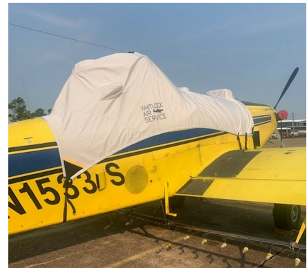
Air Tractor AT-402 Canopy/Hopper Cover