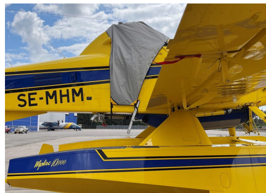
Air Tractor Light Weight Canopy Cover