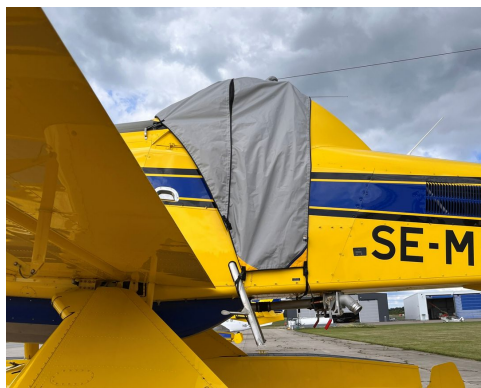
Air Tractor Light Weight Canopy Cover

Travel Covers are made with Silver Solution-Dyed Polyester fabric and only lined over the windshield to save weight. The material is lightweight and more compact for easy stowage in the aircraft. The polyester material is water resistant, but only intended for occasional use outside. We also have an ultra lightweight material available for fitted hangar dust covers. For daily outdoor use, the non-travel Sunbrella Cover is the best choice.