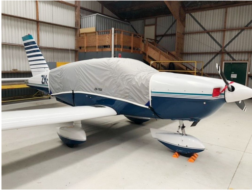
Socata TB-9 TRAVEL COVER, Light Weight Canopy Cover

Travel Covers are made with Silver Solution-Dyed Polyester fabric and only lined over the windshield to save weight. The material is lightweight and more compact for easy stowage in the aircraft. The polyester material is water resistant, but only intended for occasional use outside. We also have an ultra lightweight material available for fitted hangar dust covers. For daily outdoor use, the non-travel Sunbrella Cover is the best choice.