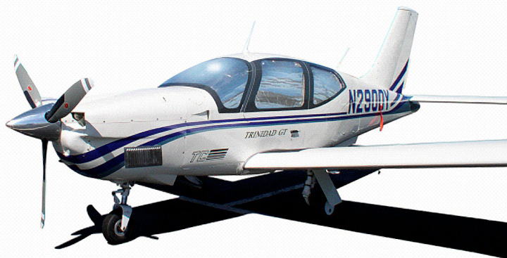
Socata TB20 HeatShields