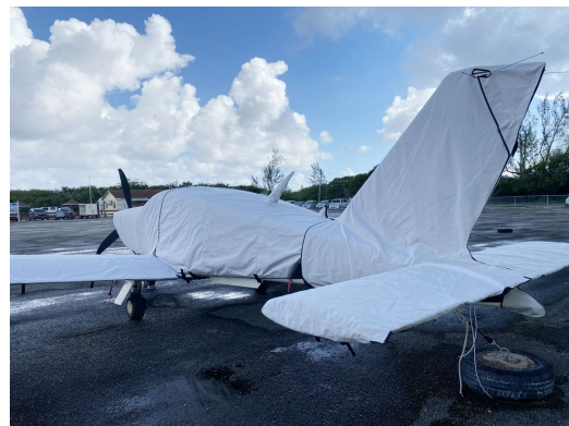
Socata Trinidad Full Cover Set