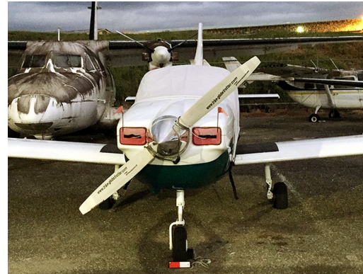
Socata TB9 Tampico Canopy Cover and Engine Inlet Plugs