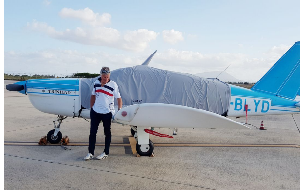
Socata Tampico, Tobago & Trinidad Travel Cover, Light Weight Canopy Cover