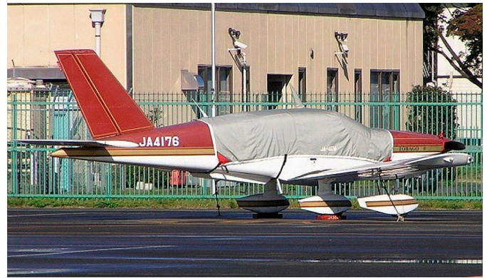
Socata TB-10 Tampico Canopy Cover