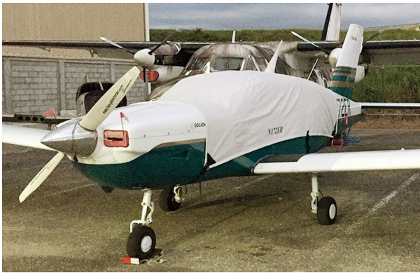
Socata TB-9 Tampico Canopy Cover and Engine Inlet Plugs

This cover type is made from Silver Acrylic Sunbrella canvas and is 100% lined with a soft and smooth microfiber. Bruce's Custom Covers developed this material combination especially for aircraft protection. The outer material is medium weight and treated for water resistance, UV resistance and anti-static buildup. The inner lining is a very soft and smooth microfiber to prevent scratching. The material is very reflective, and tests show that the cabin interior temperature can be reduced to near-ambient temperature on the hottest of days. It is water, ice and snow repellent, yet breathable to allow moisture to escape from between the cover and the aircraft surface.