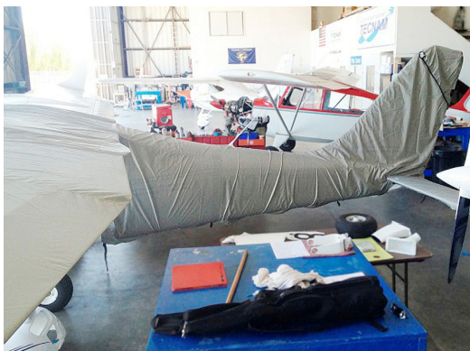
Tecnam Twin Wing & Empennage Covers

This cover type is made from Silver Acrylic Sunbrella canvas and is 100% lined with a soft and smooth microfiber. Bruce's Custom Covers developed this material combination especially for aircraft protection. The outer material is medium weight and treated for water resistance, UV resistance and anti-static buildup. The inner lining is a very soft and smooth microfiber to prevent scratching. The material is very reflective, and tests show that the cabin interior temperature can be reduced to near-ambient temperature on the hottest of days. It is water, ice and snow repellent, yet breathable to allow moisture to escape from between the cover and the aircraft surface.