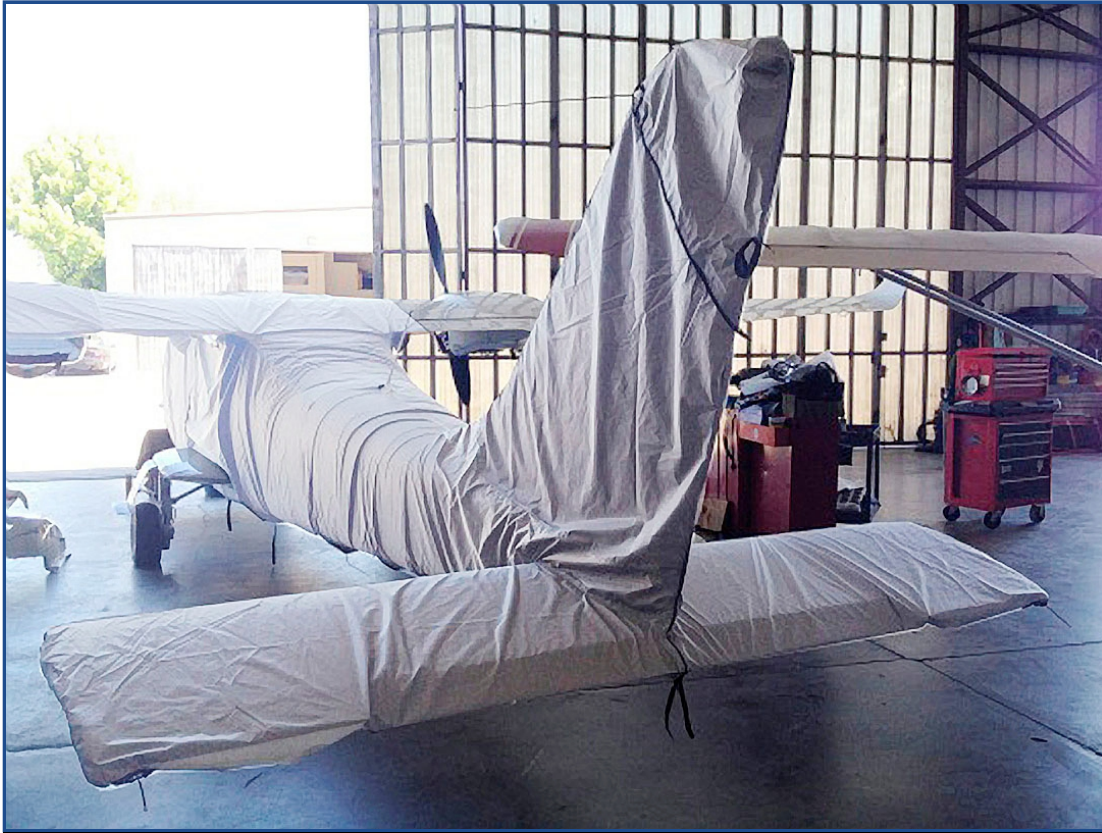
Tecnam Twin Canopy/Nose, Empennage, Wing/Engine, &amp; Propellor/Spinner Covers