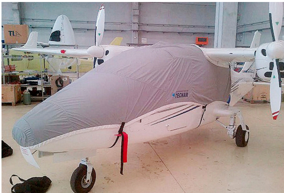
Tecnam P2006T Twin Lightweight Travel Canopy/Nose Cover

Travel Covers are made with Silver Solution-Dyed Polyester fabric and only lined over the windshield to save weight. The material is lightweight and more compact for easy stowage in the aircraft. The polyester material is water resistant, but only intended for occasional use outside. We also have an ultra lightweight material available for fitted hangar dust covers. For daily outdoor use, the non-travel Sunbrella Cover is the best choice.