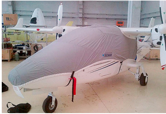
Tecnam P2006T Twin Lightweight Travel Canopy/Nose Cover

occasional use outside. We also have an ultra lightweight material available for fitted hangar dust covers. For daily outdoor use, the non-travel Sunbrella Cover is the best choice.