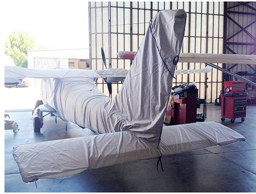
Tecnam Twin Wing & Empennage Covers Tecnam Twin Canopy/Nose, Empennage, Wing/Engine, & Propellor/Spinner Covers