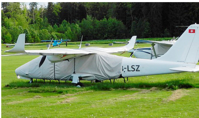
Tecnam Twin Extended Canopy/Nose Cover

This cover type is made from Silver Acrylic Sunbrella canvas and is 100% lined with a soft and smooth microfiber. Bruce's Custom Covers developed this material combination especially for aircraft protection. The outer material is medium weight and treated for water resistance, UV resistance and anti-static buildup. The inner lining is a very soft and smooth microfiber to prevent scratching. The material is very reflective, and tests show that the cabin interior temperature can be reduced to near-ambient temperature on the hottest of days. It is water, ice and snow repellent, yet breathable to allow moisture to escape from between the cover and the aircraft surface.