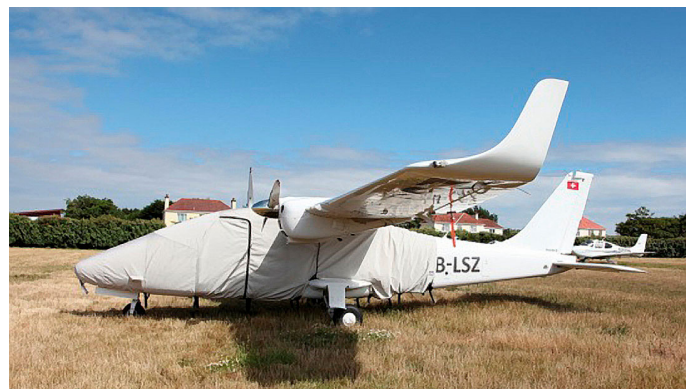
Tecnam Twin Extended Canopy/Nose Cover