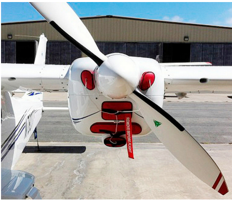
Tecnam P2006T Engine Plugs

Engine Inlet Plugs are custom fit for your Tecnam P2012 Traveller intakes, made with heavy-duty vinyl material, and stuffed with a single block of sculpted urethane foam. Each plug has a zipper that allows the foam to be removed and dried if necessary. Engine plugs have warning flags that are visible from the cockpit or 'remove before flight' streamers sewn onto the face of the plugs. Most plugs are imprinted with the aircraft registration number in black for an extra charge. Storage bag NOT included. Engine plugs may be inserted after flight when the engine is still warm. Engine Inlet Plugs are commonly referred to as Cowl Plugs, Intake Plugs, Cowl Blocks, Engine Blocks, and Engine Bungs.