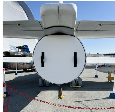
Lockheed U-2 Exhaust Plug, test fit plug