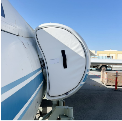
Lockheed U-2 Intake Plugs, test fit plug

This cover type is made from Silver Acrylic Sunbrella canvas and is 100% lined with a soft and smooth microfiber. Bruce's Custom Covers developed this material combination especially for aircraft protection. The outer material is medium weight and treated for water resistance, UV resistance and anti-static buildup. The inner lining is a very soft and smooth microfiber to prevent scratching. The material is very reflective, and tests show that the cabin interior temperature can be reduced to near-ambient temperature on the hottest of days. It is water, ice and snow repellent, yet breathable to allow moisture to escape from between the cover and the aircraft surface.