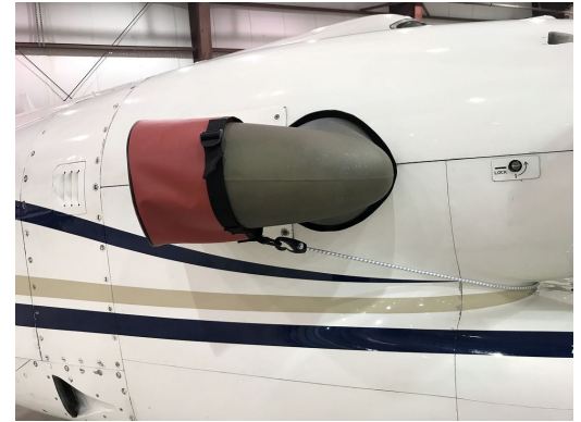
Beech King Air 350 Exhaust Covers