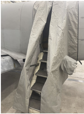
King Air Airstair Door Cover

WINTER USE MATERIAL - Made with Solution-Dyed Polyester fabric, this option is intended for seasonal use to aid in deicing, rain mitigation, or for occasional travel. The material is lighter and more compact, but more susceptible to UV damage and may have a shorter useful life if used continuously outside than the all-year use material.