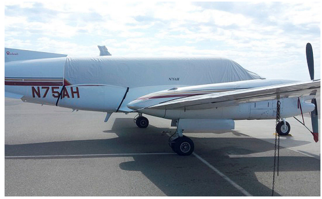
King Air 350 Canopy Cover