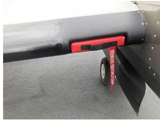
Beech King Air Heat Exchanger Inlet Plug