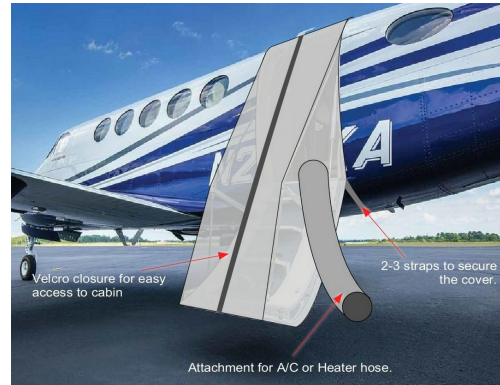
King Air Airstair Coor Cover