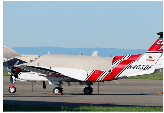
Beech King Air B200 Canopy/Nose Cover