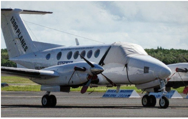
King Air 200