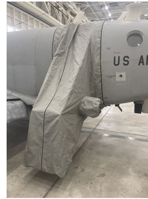
King Air Airstair Door Cover