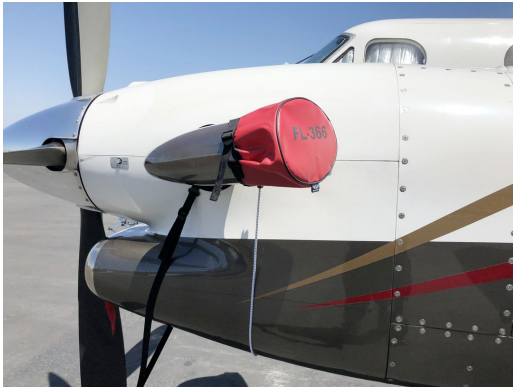
Beech King Air 350 Prop Tie-Downs/Exhaust Covers Combination

The material is very reflective, and tests show that the cabin interior temperature can be reduced to near-ambient temperature on the hottest of days. It is water, ice and snow repellent, yet breathable to allow moisture to escape from between the cover and the aircraft surface.