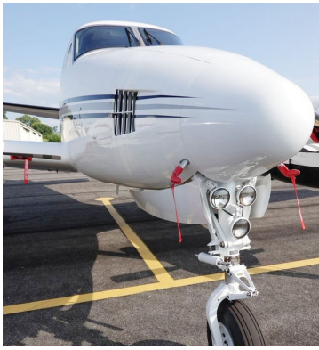
Beech King Air C90 Pitot Covers, Heat Exchanger Plugs