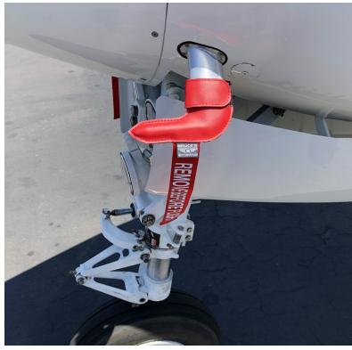
Beech King Air Pitot Covers