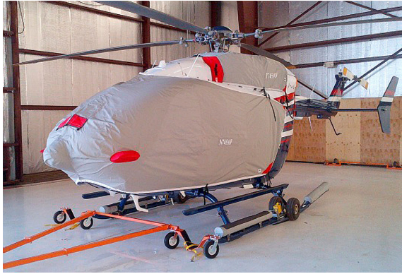
Bubble Cover w/ nose mounted radome & Upper Deck Plugs/Cover

Covers developed this material combination especially for aircraft protection. The outer material is medium weight and treated for water resistance, UV resistance and anti-static buildup. The inner lining is a very soft and smooth microfiber to prevent scratching. The material is very reflective, and tests show that the cabin interior temperature can be reduced to near-ambient temperature on the hottest of days. It is water, ice and snow repellent, yet breathable to allow moisture to escape from between the cover and the aircraft surface.