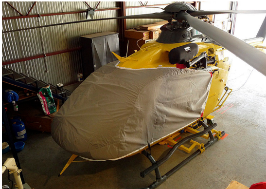
Eurocopter EC-135 Bubble Cover

Covers developed this material combination especially for aircraft protection. The outer material is medium weight and treated for water resistance, UV resistance and anti-static buildup. The inner lining is a very soft and smooth microfiber to prevent scratching. The material is very reflective, and tests show that the cabin interior temperature can be reduced to near-ambient temperature on the hottest of days. It is water, ice and snow repellent, yet breathable to allow moisture to escape from between the cover and the aircraft surface.