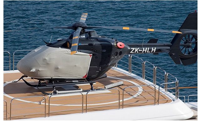
EC-135 Bubble Cover & Exhaust Plugs