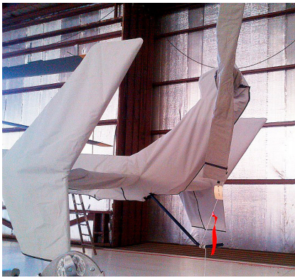
Tail Rotor Cover & Tailboom, Vertical Pylon & Stabilizers Cover