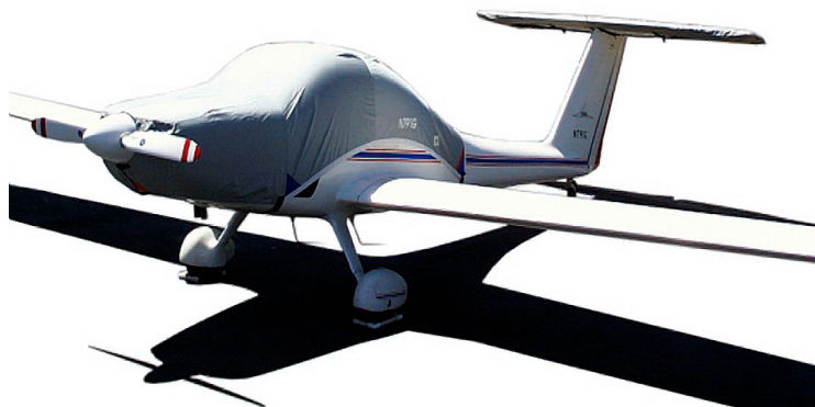
Grob 109 Canopy/Engine Cover & Horiz. Stabilizer Cover