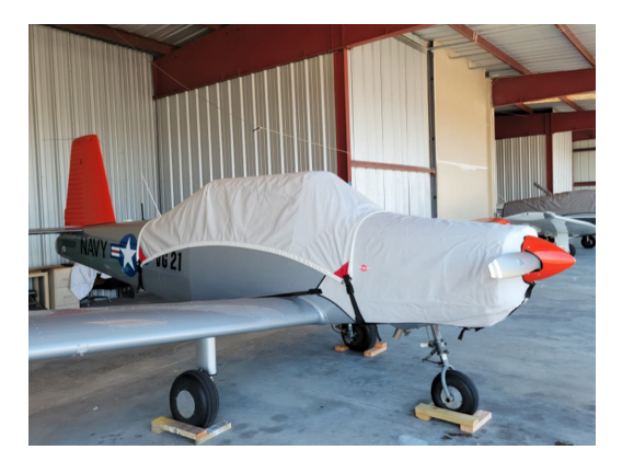
Varga Kachina Canopy & Engine Covers

This cover type is made from Silver Acrylic Sunbrella canvas and is 100% lined with a soft and smooth microfiber. Bruce's Custom Covers developed this material combination especially for aircraft protection. The outer material is medium weight and treated for water resistance, UV resistance and anti-static buildup. The inner lining is a very soft and smooth microfiber to prevent scratching. The material is very reflective, and tests show that the cabin interior temperature can be reduced to near-ambient temperature on the hottest of days. It is water, ice and snow repellent, yet breathable to allow moisture to escape from between the cover and the aircraft surface.