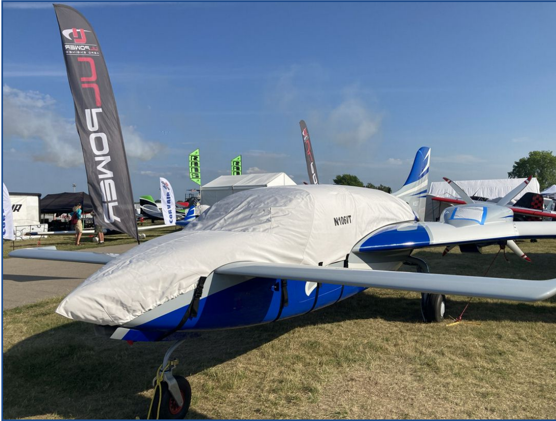
Twin Velocity Canopy/Nose Cover