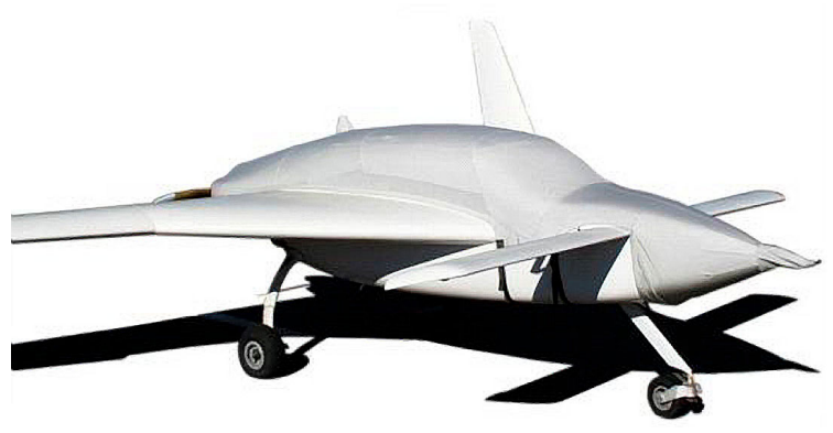
Velocity All Models: Standard, 173, XL Canopy/Nose/Engine Cover (6" Extension To Cover Wing Roots), Specify Model