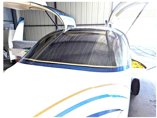
Velocity Windshield HeartShield