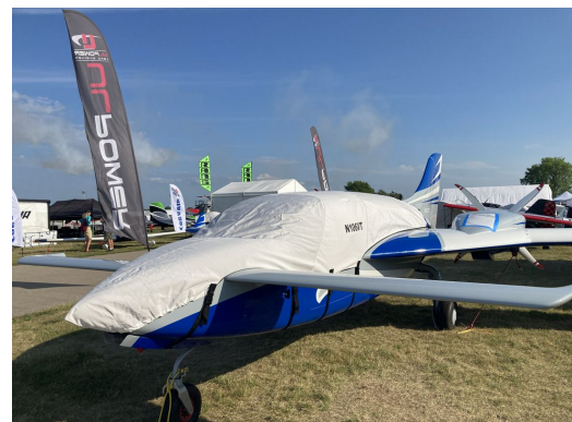
Twin Velocity Canopy/Nose Cover