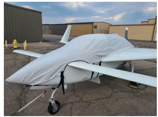
Velocity Canopy/Nose/Engine Cover