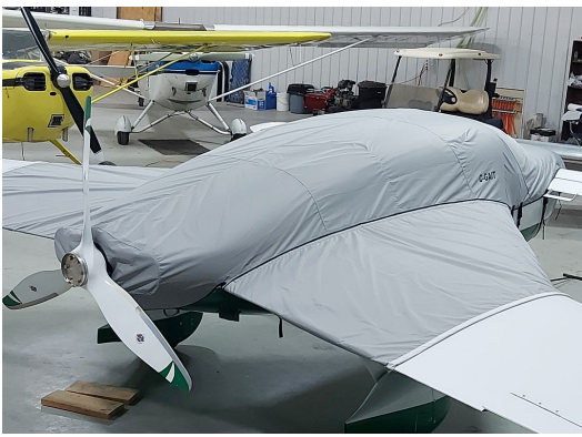
Velocity Canopy/Nose/Engine Cover, wing coverage varies