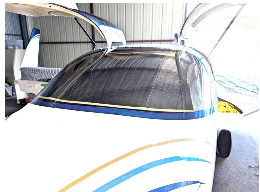
Velocity Windshield HeartShield