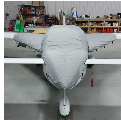
Velocity Canopy/Nose/Engine Cover, wing coverage varies