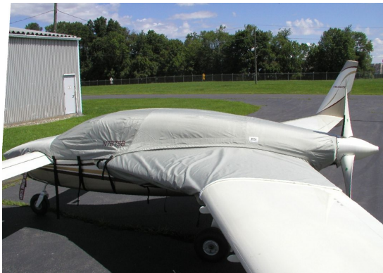
Velocity Canopy/Engine/Nose with Abbreviated Wing Covers

WINTER USE MATERIAL - Made with Solution-Dyed Polyester fabric, this option is intended for seasonal use to aid in deicing, rain mitigation, or for occasional travel. The material is lighter and more compact, but more susceptible to UV damage and may have a shorter useful life if used continuously outside than the all-year use material.