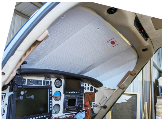
Velocity Windshield HeartShield