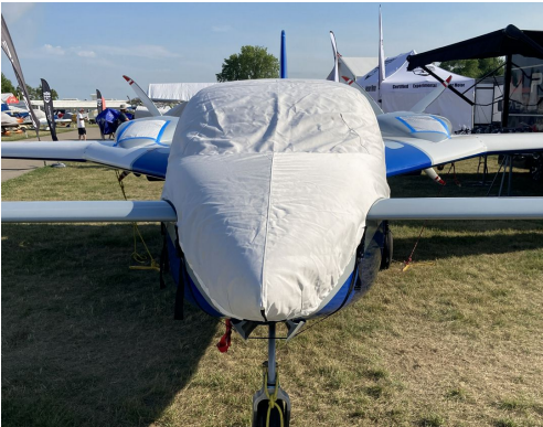
Twin Velocity Canopy/Nose Cover