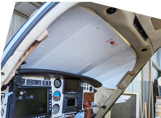
Velocity Windshield HeartShield

Heatshields are interior sunshades for an aircraft's windows or canopy glass. The product is a unique composite of closed-cell foam with a silver mylar finish. The semi-rigid design is stiff enough to stand along the inside of the windshield using sun visors or window framing. It folds up flat and easily stores in the included storage sleeve. Some designs may require velcro and suction cups. A Heatshield is an excellent short-term remedy for cockpit overheating.