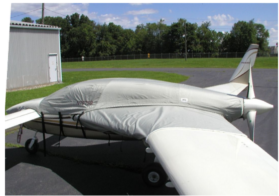
Velocity Canopy/Engine/Nose with Abbreviated Wing Covers