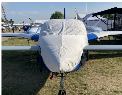
Twin Velocity Canopy/Nose Cover

Travel Covers are made with Silver Solution-Dyed Polyester fabric and only lined over the windshield to save weight. The material is lightweight and more compact for easy stowage in the aircraft. The polyester material is water resistant, but only intended for occasional use outside. We also have an ultra lightweight material available for fitted hangar dust covers. For daily outdoor use, the non-travel Sunbrella Cover is the best choice.