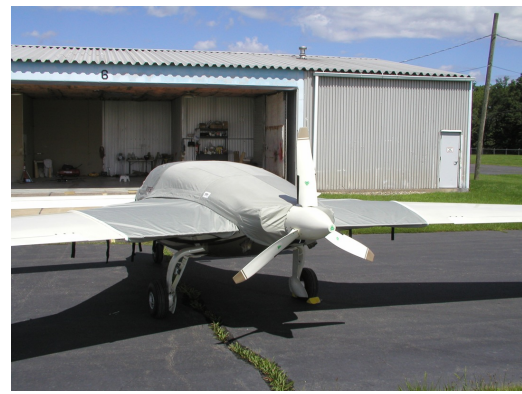
Velocity Canopy/Engine/Nose with Abbreviated Wing Covers