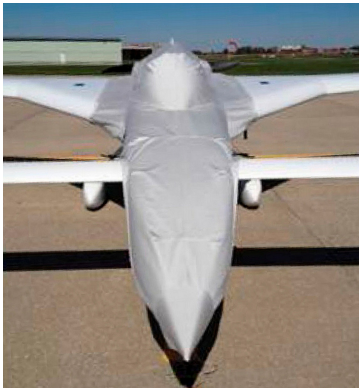
Long EZ Canopy/Nose/Engine Cover w/ Wing Extensions