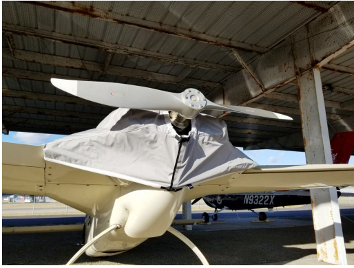
Rutan Vari EZ Travel Cover/Nose/Engine Cover