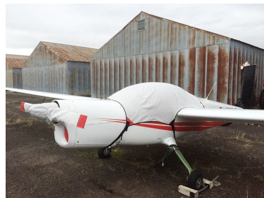
Vivat Canopy and Prop/Spinner Cover