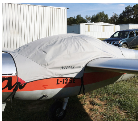
Aerotechnik L-13 Travel Cover