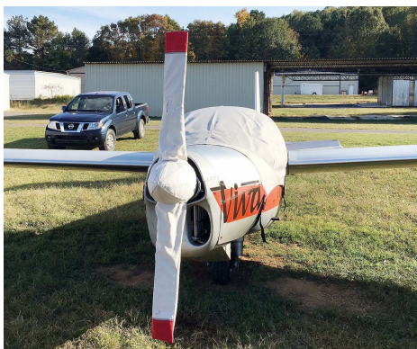
Aerotechnik L-13 Vivat Motorglider Prop/Spinner & Canopy Covers