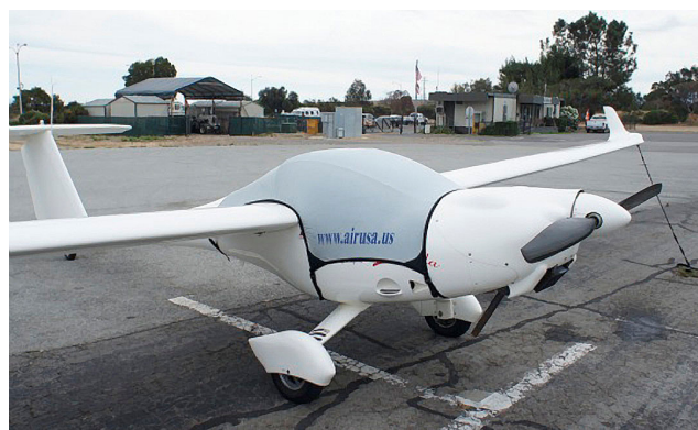
Lambada Travel Canopy Cover