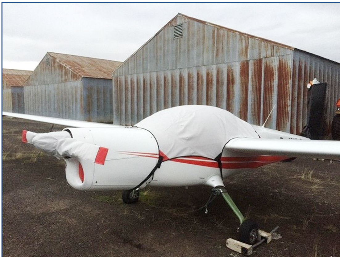
Vivat Canopy and Prop/Spinner Cover