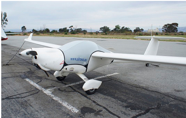
Lambda Canopy Cover