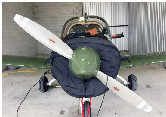
Scottish Aviation Bulldog Insulated Engine Cover