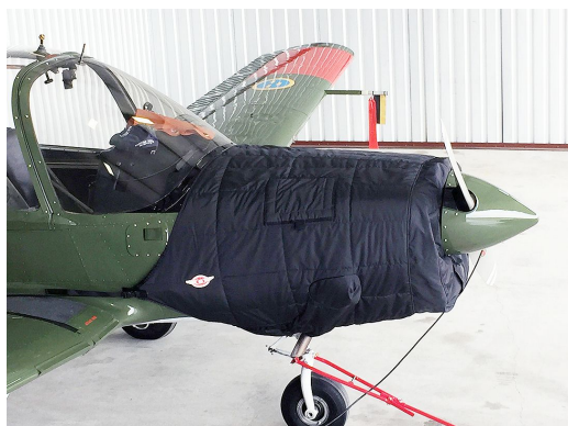
Scottish Aviation Bulldog Insulated Engine Cover

This cover type is made from Silver Acrylic Sunbrella canvas and is 100% lined with a soft and smooth microfiber. Bruce's Custom Covers developed this material combination especially for aircraft protection. The outer material is medium weight and treated for water resistance, UV resistance and anti-static buildup. The inner lining is a very soft and smooth microfiber to prevent scratching. The material is very reflective, and tests show that the cabin interior temperature can be reduced to near-ambient temperature on the hottest of days. It is water, ice and snow repellent, yet breathable to allow moisture to escape from between the cover and the aircraft surface.