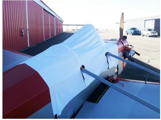
Volksplane Canopy Cover (test fit cover)