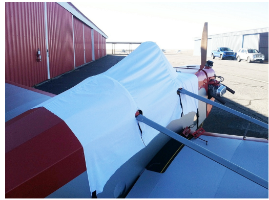
Volksplane Canopy Cover (test fit cover)