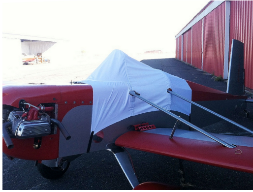
Volksplane Canopy Cover (test fit cover)

Travel Covers are made with Silver Solution-Dyed Polyester fabric and only lined over the windshield to save weight. The material is lightweight and more compact for easy stowage in the aircraft. The polyester material is water resistant, but only intended for occasional use outside. We also have an ultra lightweight material available for fitted hangar dust covers. For daily outdoor use, the non-travel Sunbrella Cover is the best choice.