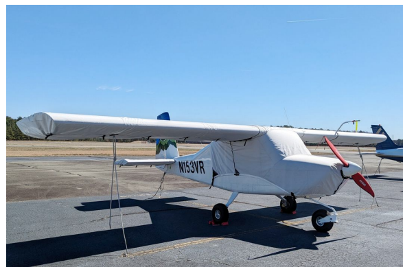
Vashon R7 Ranger Canopy/Engine, Wing & Horiz. Stab. Covers