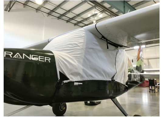
Vashon Ranger R7 Canopy Cover