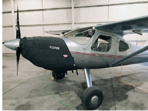
Glasair Aviation Glastar, Sportsman 2+2 Insulated Engine Cover