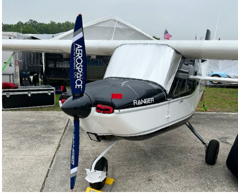
Vashon Ranger Engine Inlet Plugs

foam with a silver mylar finish. The semi-rigid design is stiff enough to stand along the inside of the windshield using sun visors or window framing. It folds up flat and easily stores in the included storage sleeve. Some designs may require velcro and suction cups or split right and left sides. A Heatshield is an excellent short-term remedy for cockpit overheating. An external fabric cover is far more effective and practical for long-term protection.