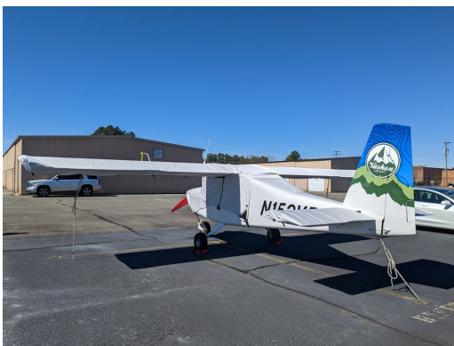
Vashon R7 Ranger Canopy/Engine, Wing & Horiz. Stab. Covers, fully enclosed

WINTER USE MATERIAL - Made with Solution-Dyed Polyester fabric, this option is intended for seasonal use to aid in deicing, rain mitigation, or for occasional travel. The material is lighter and more compact, but more susceptible to UV damage and may have a shorter useful life if used continuously outside than the all-year use material.