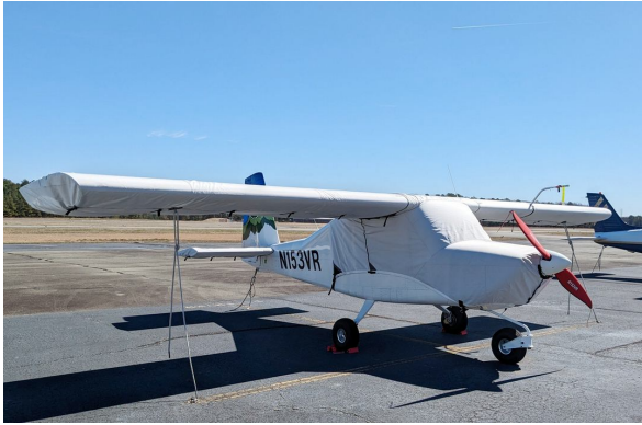
Vashon R7 Ranger Canopy/Engine, Wing & Horiz. Stab. Covers