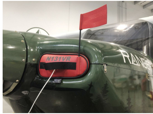
Vashon Ranger R7 Engine Plugs