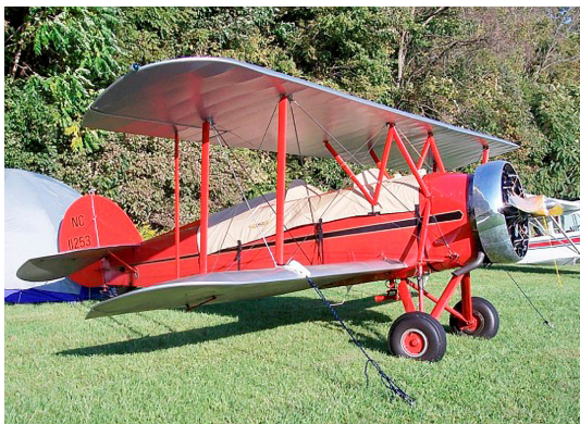
Waco ASO Canopy Cover