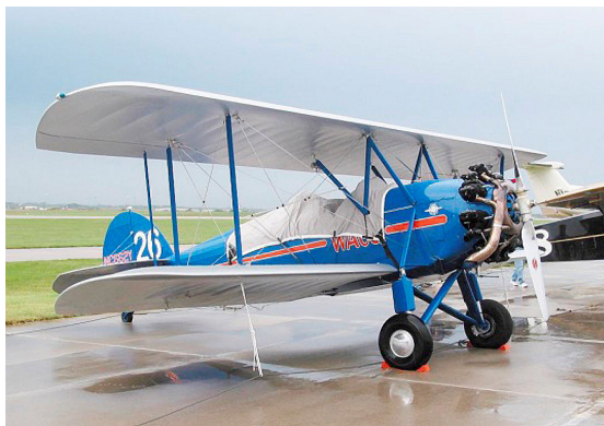
Waco ASO Canopy Cover