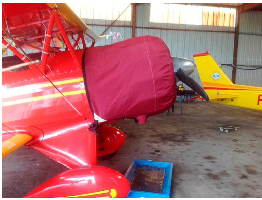
Waco Engine Cover