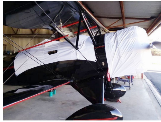
Waco UMF Canopy & Engine Covers, test fit prototypes