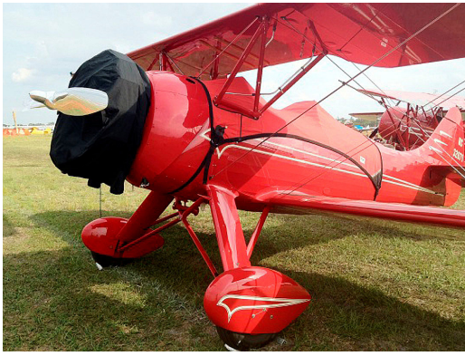
Waco UPF-7 Canopy & Engine Cover