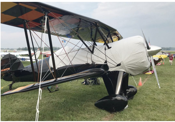
Waco Taperwing Cockpit & Engine Covers