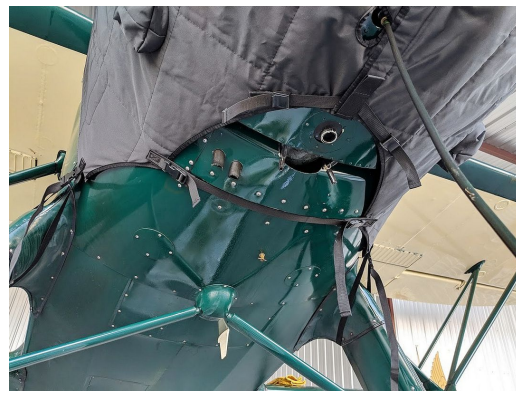
Wacon Cabin Biplane ZQC-6 Insulated Engine Cover