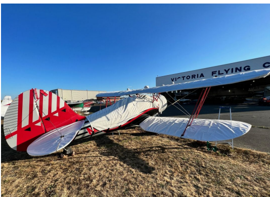
Waco YMF-5 Engine, Extended Canopy & Wing Covers Waco YMF-5 Engine, Extended Canopy, Wing Covers & Horizontal Stab Covers