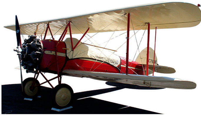
Waco 10 Canopy Cover