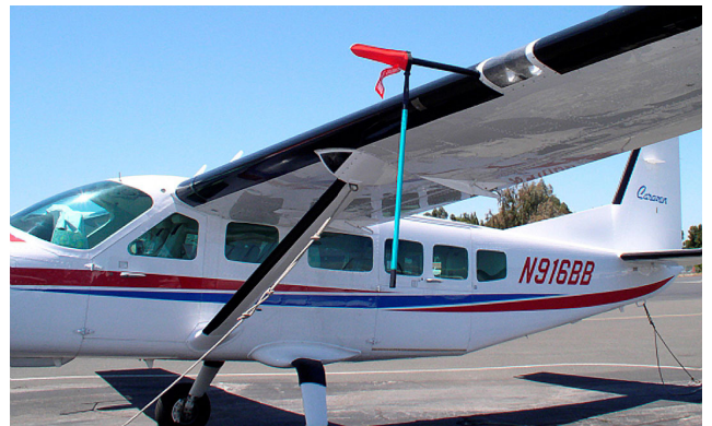
Cessna 208 Caravan Telescoping Pitot (for amphib. models)