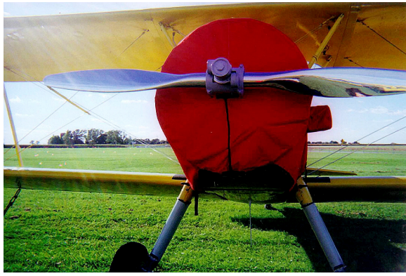
Stearman Engine Cover