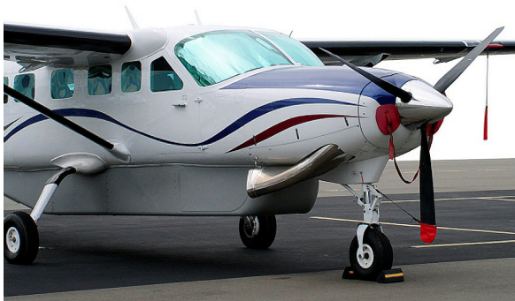
Cessna Caravan Windshield HeatShield, Plugs, Prop Ties & Pitot Cover

Waco YMF-5 Pitot Tube Covers , NOT HEAT RESISTANT TYPE, are made of Naugahyde vinyl, and are designed to cover the entire pitot assembly. Slipping over the tube, the cover tightens around the base with a Velcro strap detail. A "Remove Before Flight" streamer is attached to the cover. Heat Resistant Pitot Covers are an upgrade to this design, and help prevent the pitot cover from melting onto the tube if the pitot heat is accidentally turned on while installed. If you want the set tethered together, please let us know.