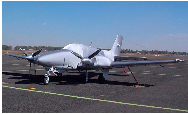
Baron FULL COVER SET, Light Weight Travel &/or Fitted Dust Cover Set