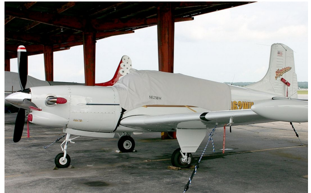
Beech Harpoon Canopy Cover, Exhaust Covers, Engine Plug