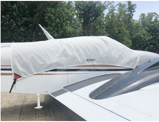
Baron G58 Travel Cover