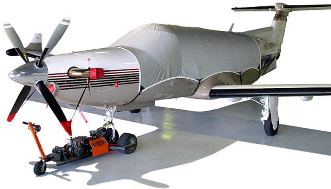
PC-12 Canopy Cover, Engine Plugs, Prop Tie/Exhaust Covers

Prop Tie-Down/Exhaust Covers are made of heavy duty red vinyl material. Thick nylon webbing runs from the exhaust covers to the prop boot. This webbing is adjustable with plastic buckles, and is held tight with a steel spring where it attaches to the prop boot.