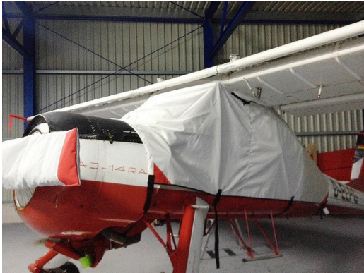
Wilga Canopy Cover and Prop Cover