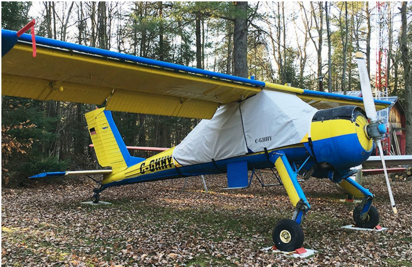
PZL-104-35 WILGA CANOPY COVER

PZL Wilga Pitot Tube Covers , NOT HEAT RESISTANT TYPE, are made of Naugahyde vinyl, and are designed to cover the entire pitot assembly. Slipping over the tube, the cover tightens around the base with a Velcro strap detail. A "Remove Before Flight" streamer is attached to the cover. Heat Resistant Pitot Covers are an upgrade to this design, and help prevent the pitot cover from melting onto the tube if the pitot heat is accidentally turned on while installed. If you want the set tethered together, please let us know.