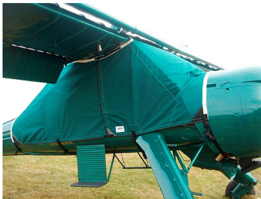
Wilga Canopy Cover