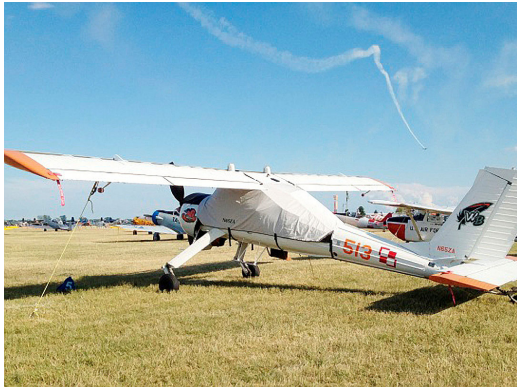
Wilga Canopy Cover

water resistance, UV resistance and anti-static buildup. The inner lining is a very soft and smooth microfiber to prevent scratching. The material is very reflective, and tests show that the cabin interior temperature can be reduced to near-ambient temperature on the hottest of days. It is water, ice and snow repellent, yet breathable to allow moisture to escape from between the cover and the aircraft surface.