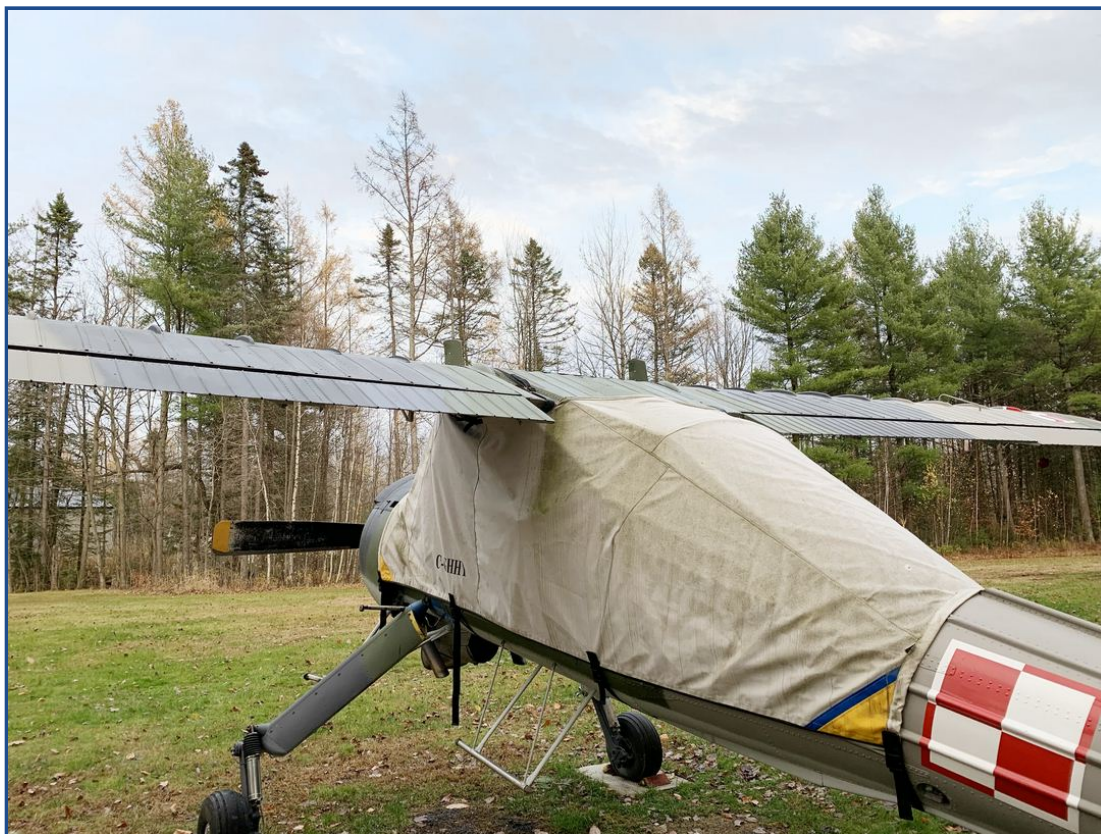
PZL Wilga Canopy Cover, Wrap-Around Type