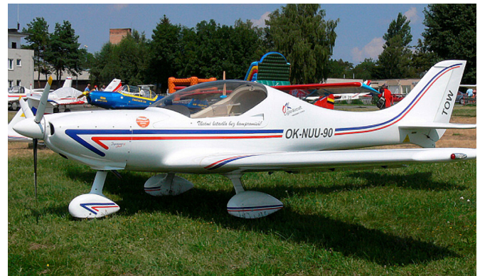
Covers, Plugs & HeatShields for Dynamic WT9