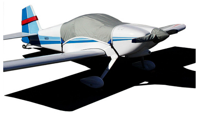
Canopy Cover, Prop Cover