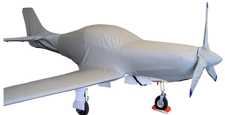
Lancair 320 Complete Fuselage/Wing Cover & Prop Cover