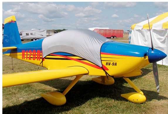
Van's RV-9A Light Weight Travel-Cover

Travel Covers are made with Silver Solution-Dyed Polyester fabric and only lined over the windshield to save weight. The material is lightweight and more compact for easy stowage in the aircraft. The polyester material is water resistant, but only intended for occasional use outside. We also have an ultra lightweight material available for fitted hangar dust covers. For daily outdoor use, the non-travel Sunbrella Cover is the best choice.