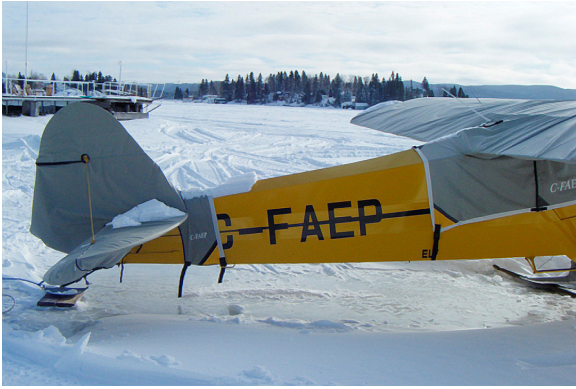
Piper J3 Cub Abbreviated Empennage Cover, Wing Covers and Canopy Cover