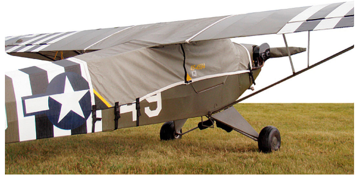
Piper J3 Extended Canopy Cover & Propellor Cover