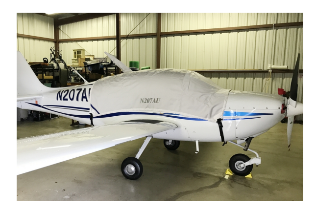
Liberty Aerospace Liberty XL-2 Canopy Cover