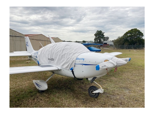
XL-2 CANOPY COVER

This cover type is made from Silver Acrylic Sunbrella canvas and is 100% lined with a soft and smooth microfiber. Bruce's Custom Covers developed this material combination especially for aircraft protection. The outer material is medium weight and treated for water resistance, UV resistance and anti-static buildup. The inner lining is a very soft and smooth microfiber to prevent scratching. The material is very reflective, and tests show that the cabin interior temperature can be reduced to near-ambient temperature on the hottest of days. It is water, ice and snow repellent, yet breathable to allow moisture to escape from between the cover and the aircraft surface.