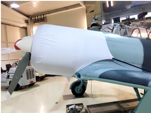
Yak 11 Engine Cover (test fit cover)