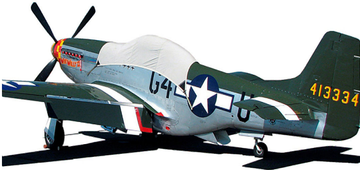
North American P51 Canopy Cover & Exhaust Plugs

Engine Inlet Plugs are custom fit for your Yakovlev Yak 3 intakes, made with heavy-duty vinyl material, and stuffed with a single block of sculpted urethane foam. Each plug has a zipper that allows the foam to be removed and dried if necessary. Engine plugs have warning flags that are visible from the cockpit or 'remove before flight' streamers sewn onto the face of the plugs. Most plugs are imprinted with the aircraft registration number in black for an extra charge. Storage bag NOT included. Engine plugs may be inserted after flight when the engine is still warm. Engine Inlet Plugs are commonly referred to as Cowl Plugs, Intake Plugs, Cowl Blocks, Engine Blocks, and Engine Bungs.