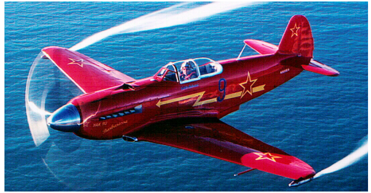
Canopy Cover for the Yak 3