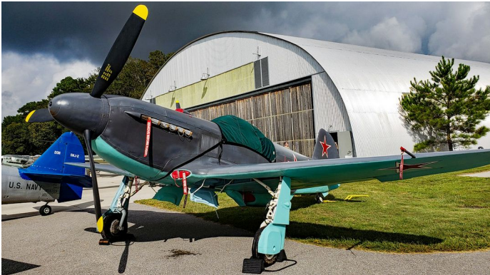
Yakovlev Yak 3 Oil Cooler Inlet Plugs (In Wing Root)