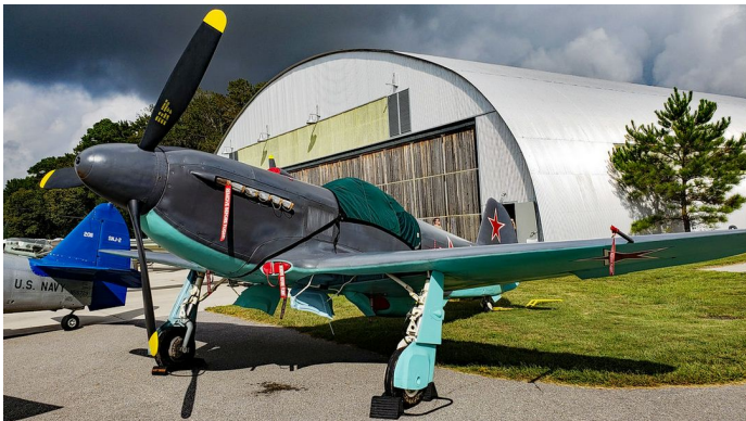
Yakovlev Yak 3 Oil Cooler Inlet Plugs (In Wing Root)

Engine Inlet Plugs are custom fit for your Yakovlev Yak 3 intakes, made with heavy-duty vinyl material, and stuffed with a single block of sculpted urethane foam. Each plug has a zipper that allows the foam to be removed and dried if necessary. Engine plugs have warning flags that are visible from the cockpit or 'remove before flight' streamers sewn onto the face of the plugs. Most plugs are imprinted with the aircraft registration number in black for an extra charge. Storage bag NOT included. Engine plugs may be inserted after flight when the engine is still warm. Engine Inlet Plugs are commonly referred to as Cowl Plugs, Intake Plugs, Cowl Blocks, Engine Blocks, and Engine Bungs.