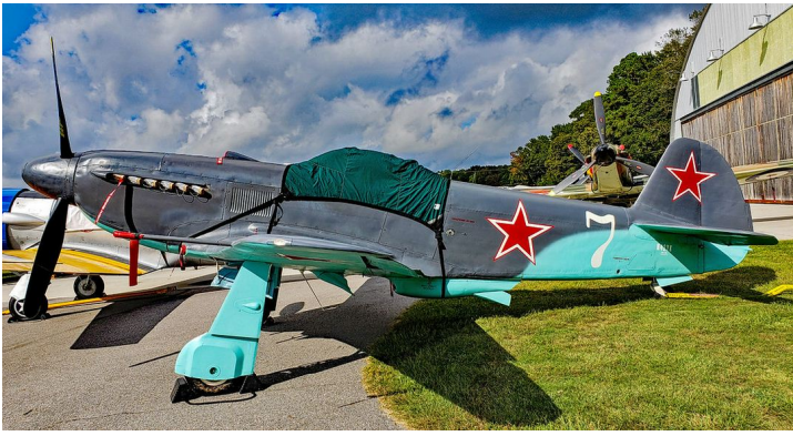
Yakovlev Yak 3 Canopy Cover (3u Models: Longer Canopy)