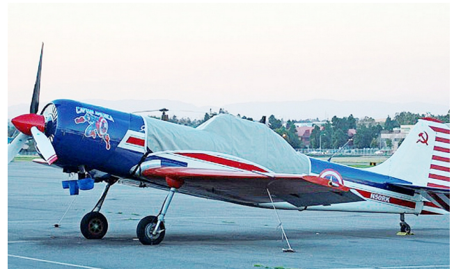
Yak 50 Canopy Cover