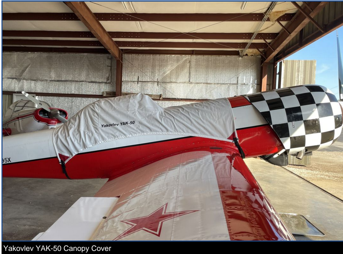
Yakovlev YAK-50 Canopy Cover