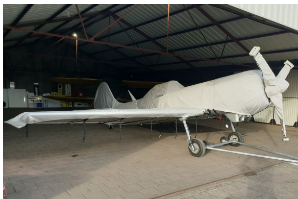
Yak 50 Complete Cover Set

WINTER USE MATERIAL - Made with Solution-Dyed Polyester fabric, this option is intended for seasonal use to aid in deicing, rain mitigation, or for occasional travel. The material is lighter and more compact, but more susceptible to UV damage and may have a shorter useful life if used continuously outside than the all-year use material.