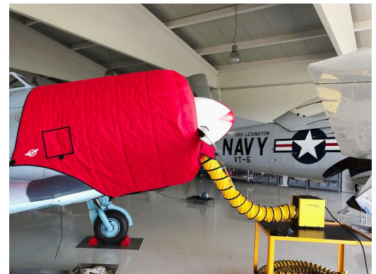
Yak 11 Insulated Engine Cover