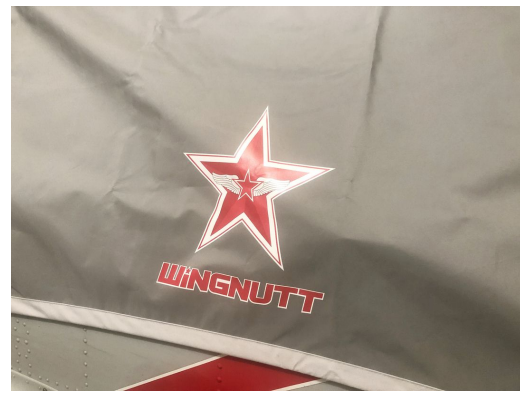
YAK 52TW Lightweight Travel Cover with Custom Artwork Imprint