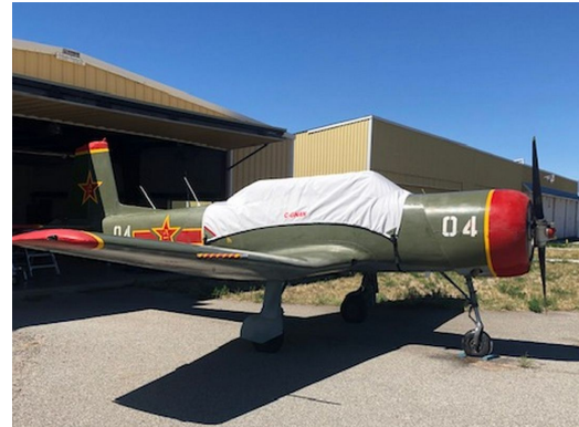
Yak 52 Canopy Cover