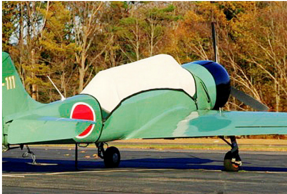
Yak 52 Canopy Cover

This cover type is made from Silver Acrylic Sunbrella canvas and is 100% lined with a soft and smooth microfiber. Bruce's Custom Covers developed this material combination especially for aircraft protection. The outer material is medium weight and treated for water resistance, UV resistance and anti-static buildup. The inner lining is a very soft and smooth microfiber to prevent scratching. The material is very reflective, and tests show that the cabin interior temperature can be reduced to near-ambient temperature on the hottest of days. It is water, ice and snow repellent, yet breathable to allow moisture to escape from between the cover and the aircraft surface.