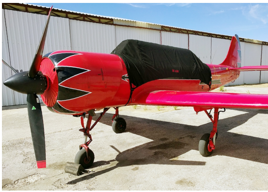
Yakovlev Yak 52 Travel Cover