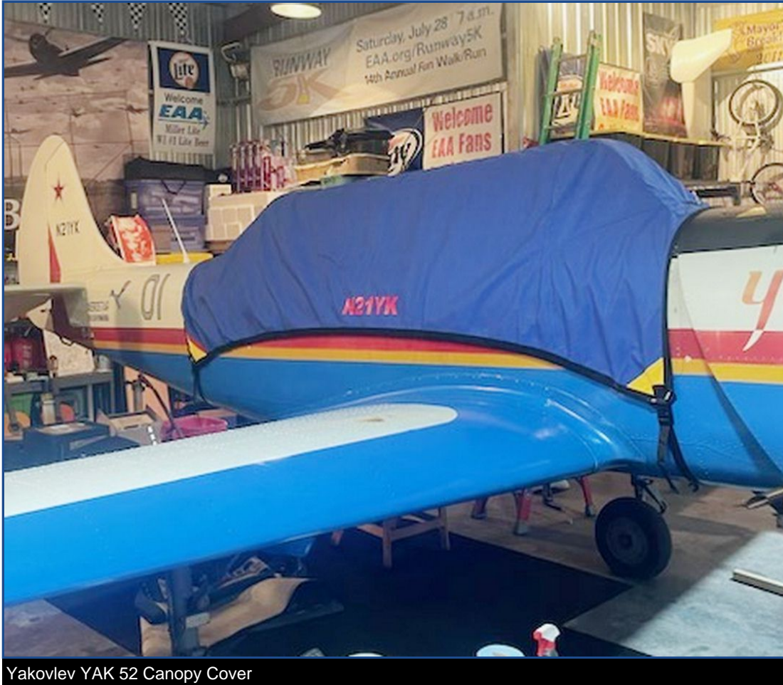
Yakovlev YAK 52 Canopy Cover