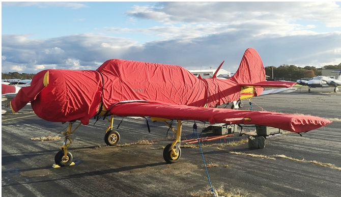
Yak 52 Full Cover Set

This cover type is made from Silver Acrylic Sunbrella canvas and is 100% lined with a soft and smooth microfiber. Bruce's Custom Covers developed this material combination especially for aircraft protection. The outer material is medium weight and treated for water resistance, UV resistance and anti-static buildup. The inner lining is a very soft and smooth microfiber to prevent scratching. The material is very reflective, and tests show that the cabin interior temperature can be reduced to near-ambient temperature on the hottest of days. It is water, ice and snow repellent, yet breathable to allow moisture to escape from between the cover and the aircraft surface.