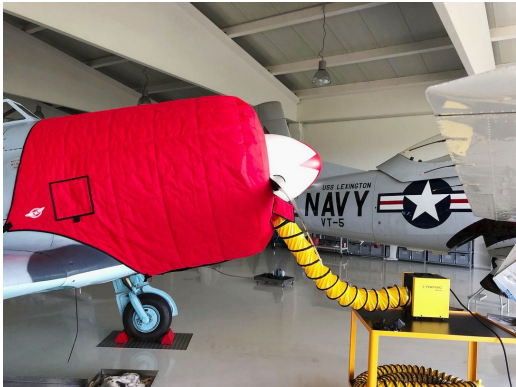
Yak 11 Insulated Engine Cover