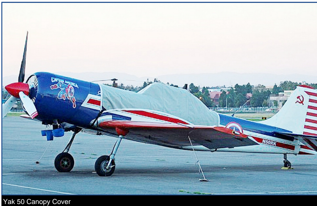
Yak 50 Canopy Cover