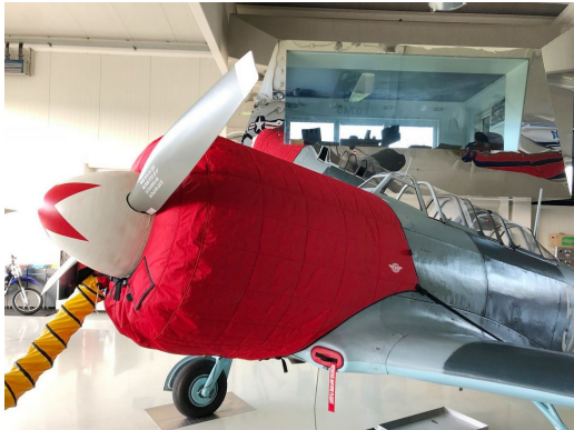
Yak 11 Insulated Engine Cover & Oil Cooler Inlet Plug

This cover type is made from Silver Acrylic Sunbrella canvas and is 100% lined with a soft and smooth microfiber. Bruce's Custom Covers developed this material combination especially for aircraft protection. The outer material is medium weight and treated for water resistance, UV resistance and anti-static buildup. The inner lining is a very soft and smooth microfiber to prevent scratching. The material is very reflective, and tests show that the cabin interior temperature can be reduced to near-ambient temperature on the hottest of days. It is water, ice and snow repellent, yet breathable to allow moisture to escape from between the cover and the aircraft surface.