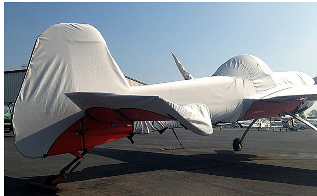
Yak 50 Insulated Hangar Blanket. 3D model Yak 55 Full Fuselage Cover w/ Detachable Wing Covers & Propellor/Spinner Cover