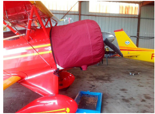
Waco Engine Cover