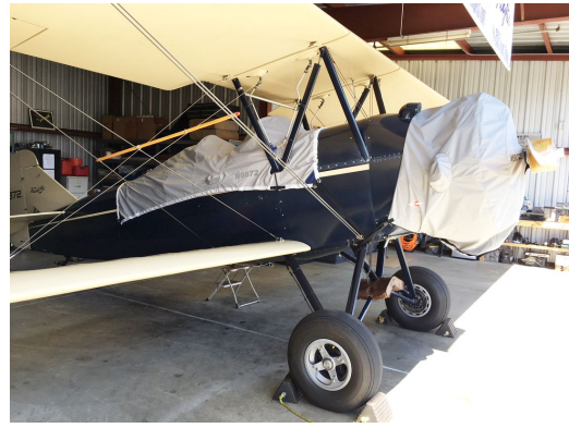
SKYBOLT, Insulated Hangar Blanket, Custom Fit Interior Use) Travel Air 4000 Canopy and Engine Covers, light weight travel type