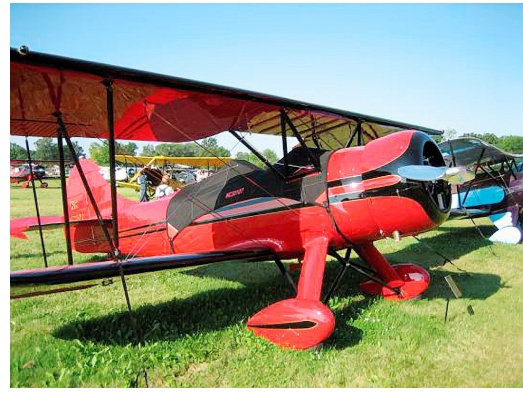
Waco UPF7 Canopy Cover