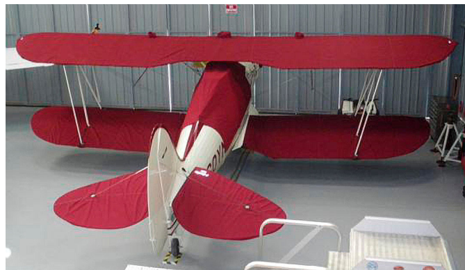
Waco UPF-7 Upper/Lower Wing Cover, Horizontal Stabilizer Cover, & Canopy Cover