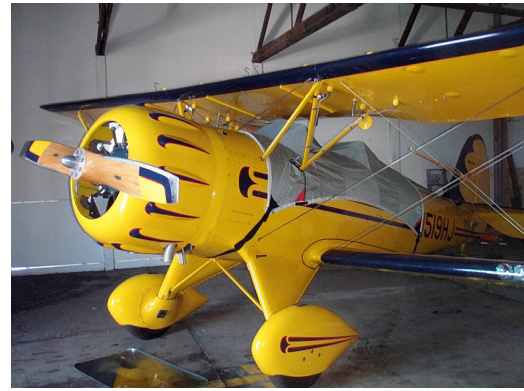
Waco YMF Canopy Cover