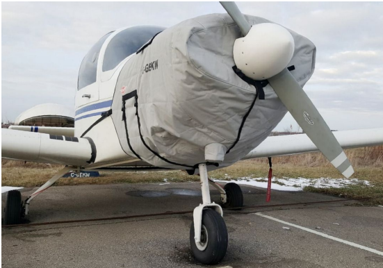
Zenith CH-2000 Insulated Engine Cover