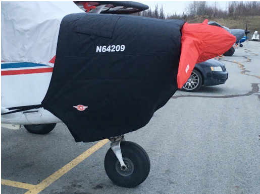
Cessna 172M Canopy, Wings, Horiz. Stab., Insulated Engine & Prop Covers

This cover type is made from Silver Acrylic Sunbrella canvas and is 100% lined with a soft and smooth microfiber. Bruce's Custom Covers developed this material combination especially for aircraft protection. The outer material is medium weight and treated for water resistance, UV resistance and anti-static buildup. The inner lining is a very soft and smooth microfiber to prevent scratching. The material is very reflective, and tests show that the cabin interior temperature can be reduced to near-ambient temperature on the hottest of days. It is water, ice and snow repellent, yet breathable to allow moisture to escape from between the cover and the aircraft surface.