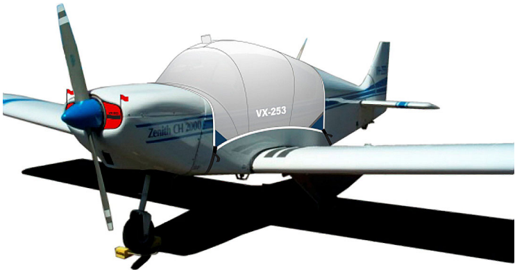
AMD Alarus CH2000 Std Canopy Cover & Engine Plugs (Illustration)