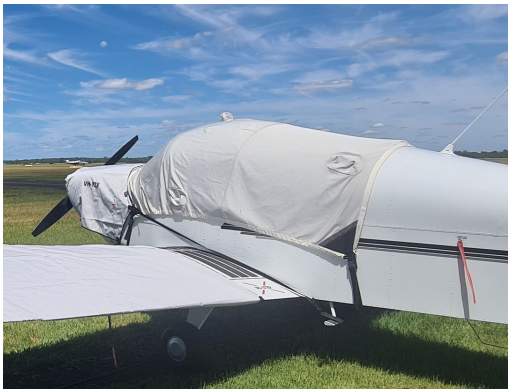
Zenith CH-2000 Canopy & Engine Covers

This cover type is made from Silver Acrylic Sunbrella canvas and is 100% lined with a soft and smooth microfiber. Bruce's Custom Covers developed this material combination especially for aircraft protection. The outer material is medium weight and treated for water resistance, UV resistance and anti-static buildup. The inner lining is a very soft and smooth microfiber to prevent scratching. The material is very reflective, and tests show that the cabin interior temperature can be reduced to near-ambient temperature on the hottest of days. It is water, ice and snow repellent, yet breathable to allow moisture to escape from between the cover and the aircraft surface.