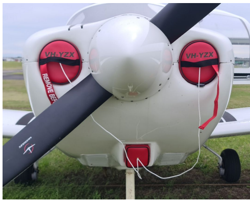
Zenith CH-2000, CH-640 Engine Inlet Plugs